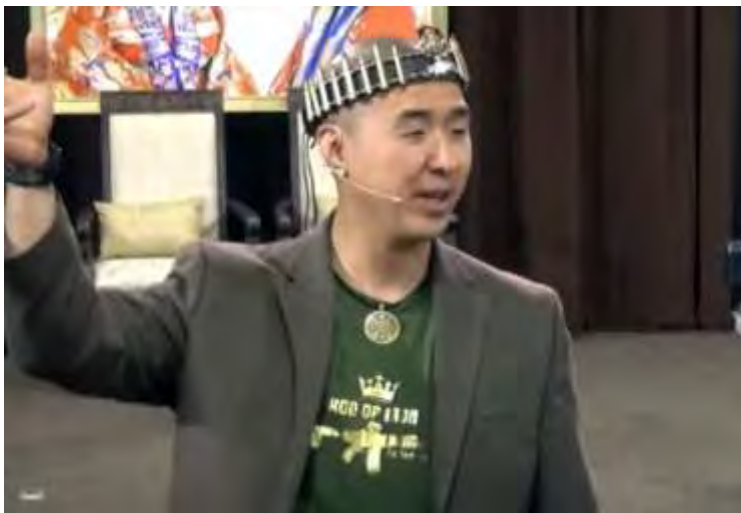
Sanctuary Service 7/12/2020

and run away from their paternal responsibility, Satan wins.