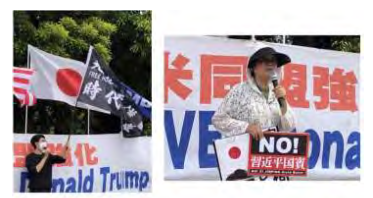
Sanctuarians in Japan demonstrating for a Free Asia