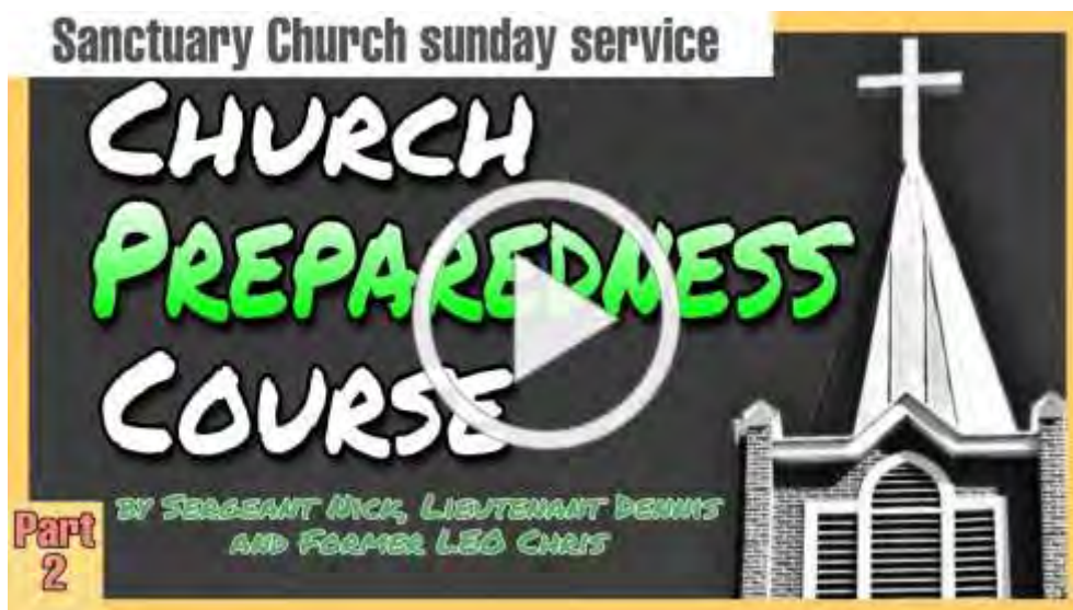
Part 2. Church Preparedness Course Sanctuary Church Sunday Service Part 2 on 3/15/20

Three in four mass shootings are in "gun free zones." Such events are responsible for 85% of mass shooting deaths. Eight in ten firearms used were purchased at gun-shops already regulated by federal requirements. Zero percent were obtained in private sales.