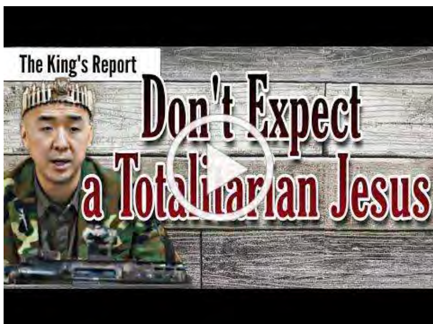
Don't Expect a Totalitarian Jesus (The King's Report 1/6/20)