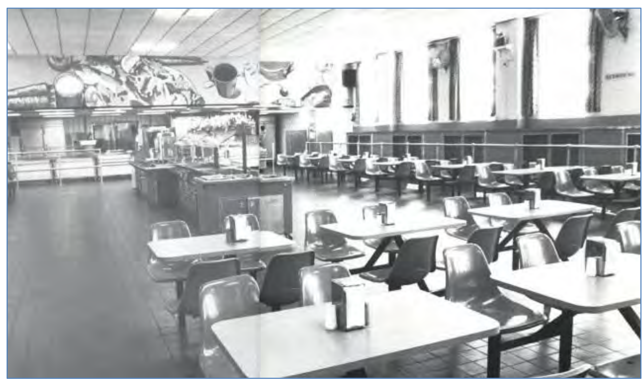
The prison cafeteria. Every morning, Father sets up the salt and pepper shakers and the napkins.

Question: You were asked to make arrangements for visitors who want to meet with Father at Danbury. Can you describe your task there in more detail?