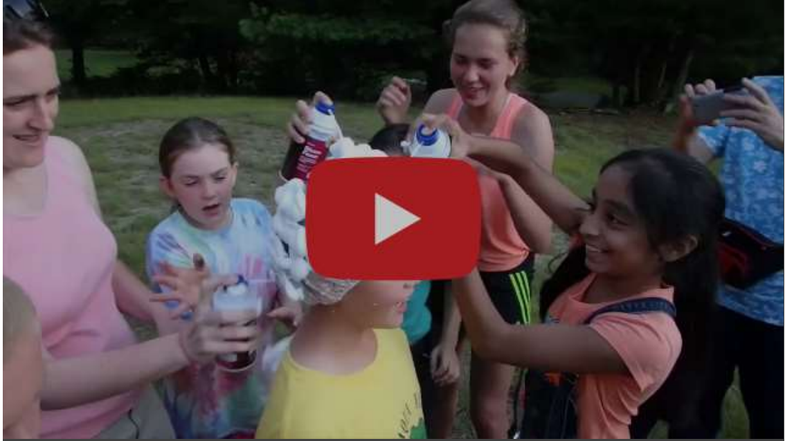
Shehaqua Family Camp Promotional Video