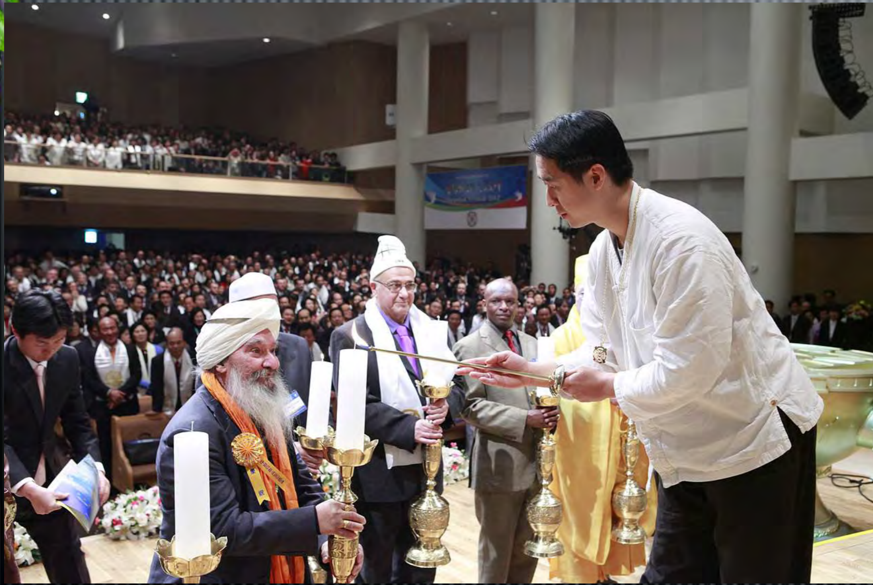
Handing over of Heavenly Nation Creation Holy Candle