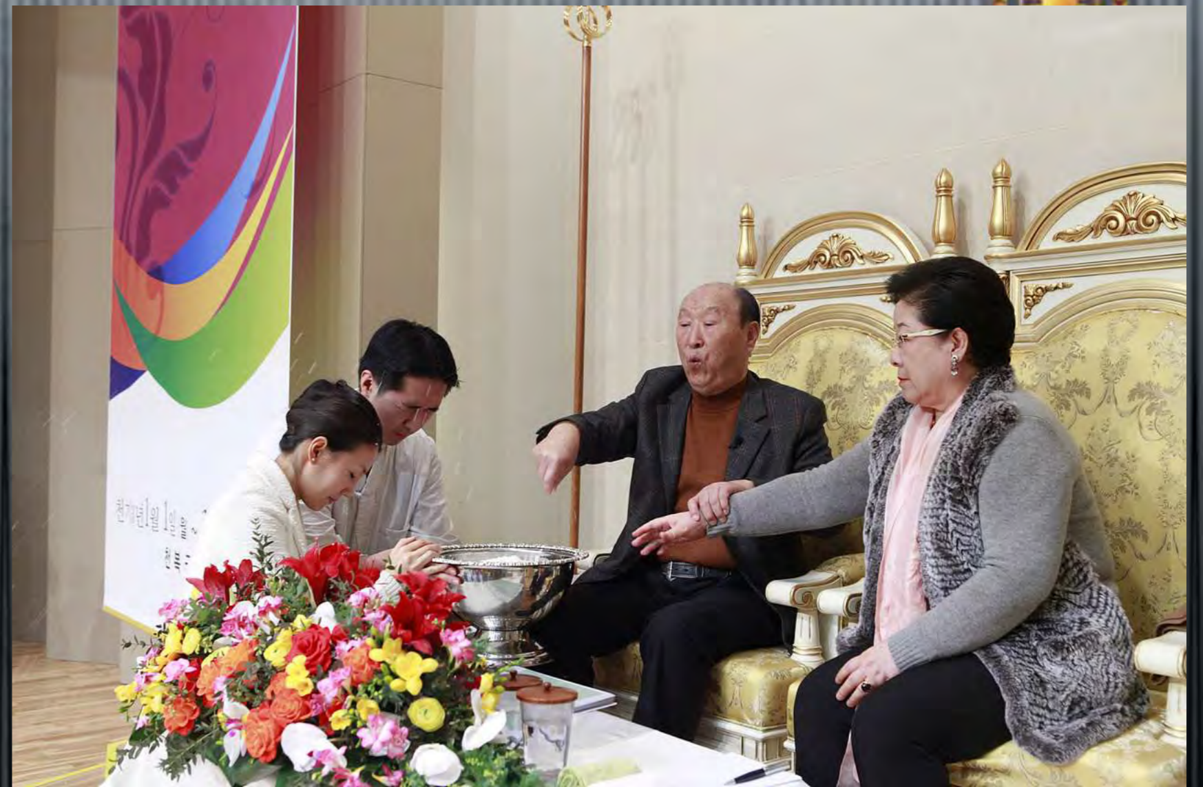
Handing over of Heavenly Nation Creation Holy Salt