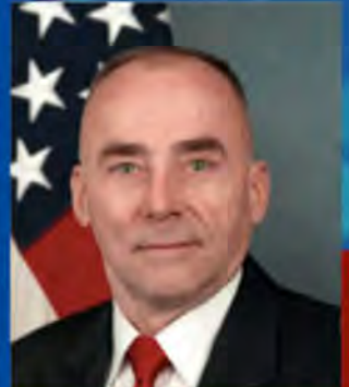
GUEST PANELIST Lt. Gen. Wallace 'Chip' Gregson

Policy and Strategy in an Age of Expanded Threats Unpacking the U.S.-Japan-Philippines trilateral summit