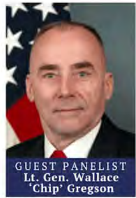
USMC, ret; former Asst Secretary of Defense, Asian and Pacific Security Affairs; former Commanding General, Marine Corps Forces Pacific

Unpacking the U.S.-Japan-Philippines trilateral summit