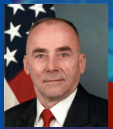
GUEST PANELIST Lt. Gen. Wallace 'Chip' Gregson

Unpacking the U.S.-Japan-Philippines trilateral summit