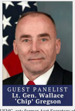
USMC, ret; former Asst Secretary of Defense, Asian and Pacific Security Affairs; former Commanding General, Marine Corps Forces Pacific