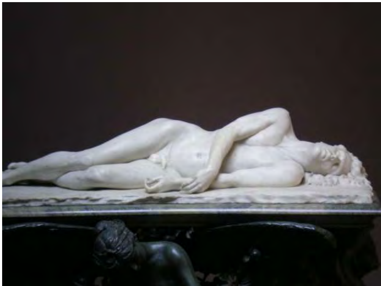
Percy Shelly's statue

After you pass on, you have no control over the kinds of monuments people make to remember you by. I hope I fare better than Shelley's statue.