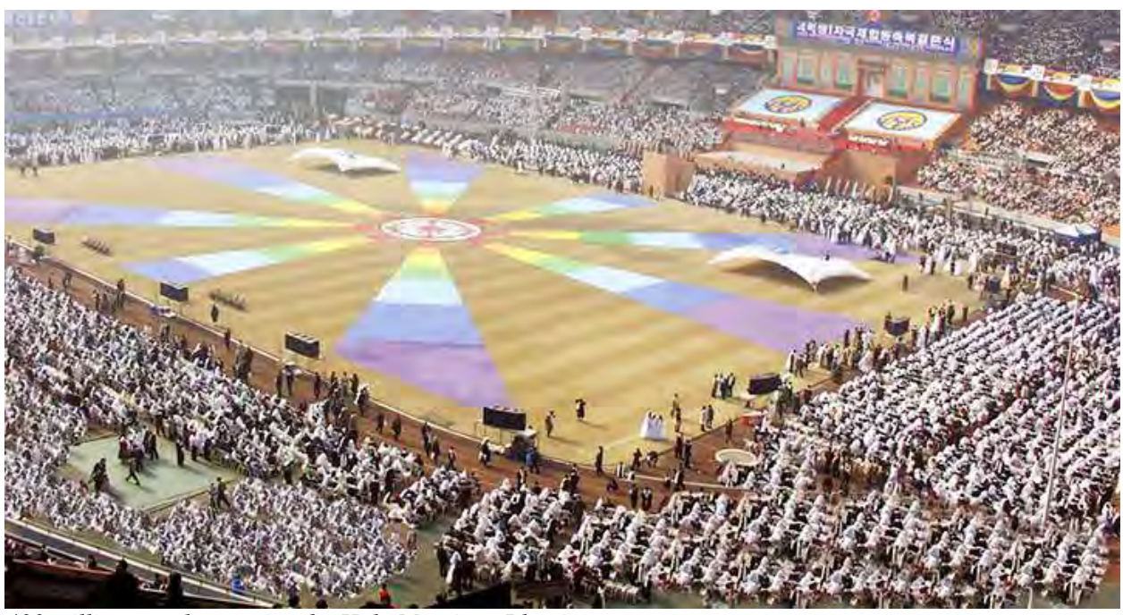
400 million couples receive the Holy Marriage Blessing.