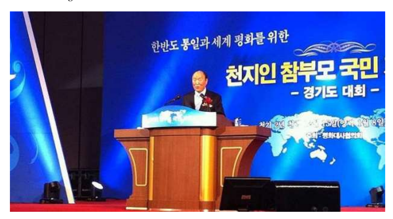
January 8, 2012 True Father Begins Cosmic Assemblies for the Settlement of the True Parents

From January 8 to 15, 2012, True Father conducted rallies in eight Korean cities in which he proclaimed the conclusion and fulfillment of the providence of restoration during True Parents' lifetime. He stated, "The path taken by the True Parents shall serve as a tradition and historic example" and asked that all "model your life course on this path, become families that pledge to inherit and fulfill the will of God that True Parents have already accomplished, and be true to this pledge." His <a href="speech">speech</a> included the topics the Three Stages of Life, the Seonghwa Ascension Ceremony, One Family under God, the Mission of the Korean People, the Path Humankind Should Take, his Final Words for Humankind, the Proclamation of the Era of the Parents of Heaven, Earth and Humankind, and the Advent of the Era of the New Substantial Image.