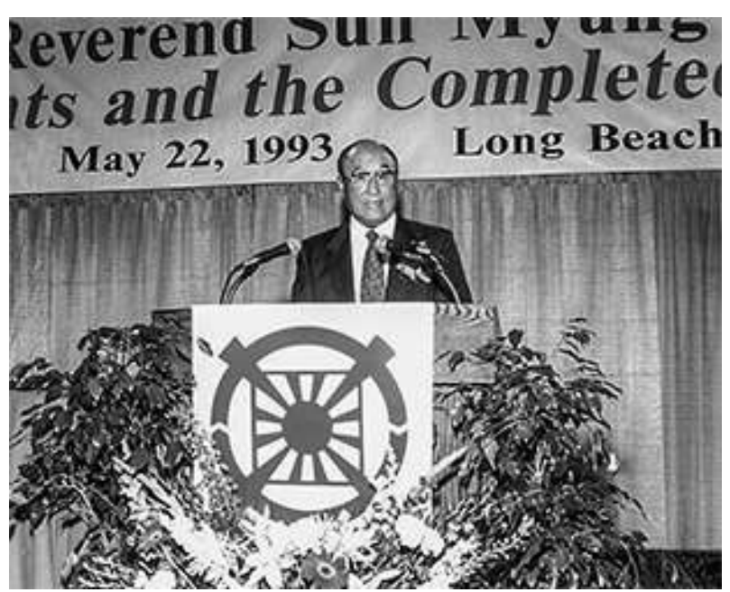
After proclaiming the Completed Testament Age on January 10, True Parents toured the nation and spoke on this theme.

On August 24, 1992, at the first World Culture and Sports Festival (WCSF) and on the foundation of the Cold War's end, True Father declared that he and True Mother "are the True Parents of all humanity ... the Savior, the Lord of the Second Advent, the Messiah." It was hard to imagine how True Father could proclaim anything more dramatic than that. However, he may have succeeded in doing so by proclaiming the beginning of a completely new historical epoch. In a speech, "The Reappearance of the Second Coming and the Completed Testament Era," delivered at the Belvedere International Training Center, Tarrytown, New York, on January 10, 1993, True Father announced "the transition today to the Completed Testament Era." Details as to the precise nature of the new epoch were as yet sketchy, but it was understood to involve a fundamental shift in the order of salvation. As one church leader explained, "Previously, religious organizations have always been centered upon the salvation of the individual, but we have now progressed to the salvation of the family."