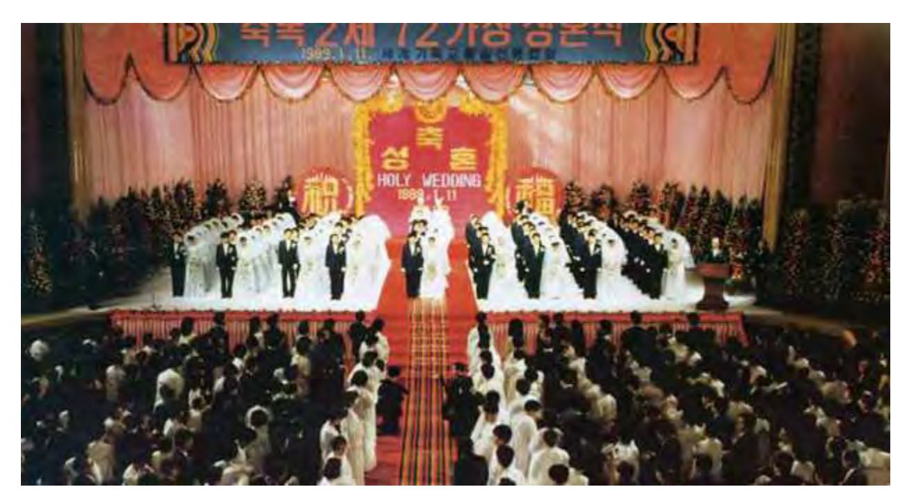
January 11, 1989 72-Couple Holy Blessing of Second-Generation Unificationists

Seventy-two couples made up of Unificationist-born young adults received the Marriage Blessing in January 1989. Together with the Blessing of the 36 Unificationist-born couples three years earlier, the victory of this Blessing, according to True Father, could be likened to the complete restoration of the 12 apostles and 72 disciples at the time of Jesus.