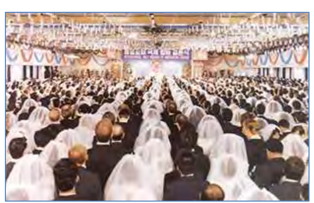
1,275 couples received the Marriage Blessing.

True Parents blessed 1,275 couples from 87 nations on January 12, 1989. The ceremony was conducted at 2 p.m. in the Il Hwa Company compound in Yongin, Korea. The ceremony followed by one day True Parents' Holy Marriage Blessing of 72 Unificationist-born couples at the Little Angels Performing Arts Center in Seoul. After the ceremony, representatives of the couples were mobilized into 43 groups of 10 each and spread out across Korea to support witnessing activities and, later, the distribution of the Segye Ilbo newspaper.