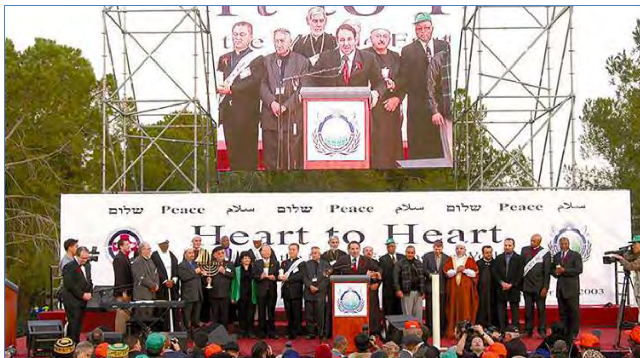
A rally was held at Jerusalem's Peace Park

True Parents set important conditions, centered on the American Clergy Leadership Conference (ACLC), for the reconciliation of the Abrahamic faith traditions of Judaism, Christianity and Islam. In 2003, True Father called upon Christian clergy to "exchange the cross for a crown" as a foundation for traveling to the Holy Land and reconciling with their Jewish brethren. Some 131 members of the clergy did so and went to Jerusalem, where they met a like number of Israeli rabbis and jointly signed the Jerusalem Declaration, which repented for "dark parts of our past" and sought a "bright future" together.