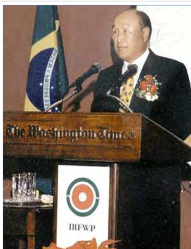
True Father speaks at the IRFWP conference.