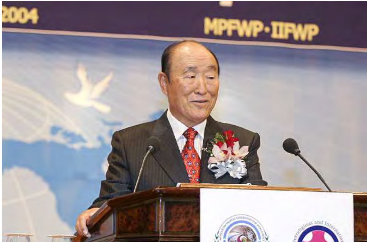
True Father speaks at the International Peace Conference for Mongolian Leaders from Around the World

True Father established numerous Federations for World Peace following the end of the Cold War and into the new millennium. From September 21-24, 2004, the first International Peace Conference for Mongolian Leaders from Around the World took place in Seoul. This conference led to the creation of the Mongolian Peoples' Federation for World Peace (MPFWP). True Father defined Mongolian peoples as those born with the Mongolian birthmark, a bluish mark usually seen on the backside. He asserted that nearly three-quarters of the world's population is linked to Mongolian roots and that the Mongolian birthmark appears not only in persons of the yellow race but also among many black and white people. He maintained that values preserved among Mongolian peoples, such as faith in absolute values, an understanding of human spirituality, belief in the existence of the spirit world, an emphasis on family tradition and the importance of lineage would play a significant role in bringing about the realization of a world of peace. The initial conference brought together 300 participants from Mongolia, Korea, Japan, China and 34 other nations. The Mongolian Federation convened subsequent meetings under the auspices of the Universal Peace Federation.