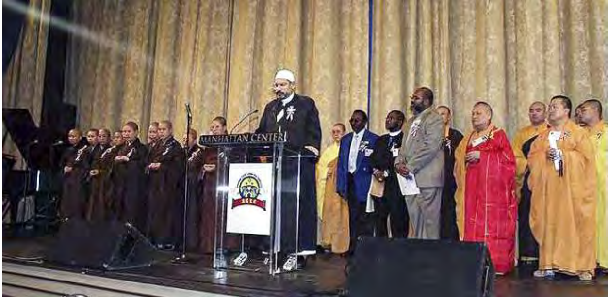
More than 1,000 clergy from all faiths attended the Interfaith Prayer Breakfast and Day of Prayer and Healing to offer prayers for the victims of the 9/11 tragedy in New York and Washington, D.C.