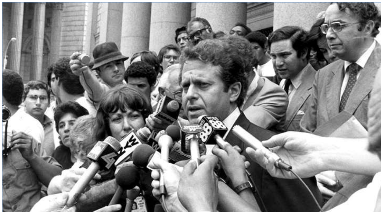
Harvard Law scholar Lawrence Tribe speaking on True Father's court proceedings at the Federal Court House in New York

In his book Inquisition, The Persecution and Prosecution of the Reverend Sun Myung Moon , Pulitzer Prize-winning journalist Carlton Sherwood argued that True Father's 1981 conviction on tax evasion charges was the result of "the most intensive and expensive criminal tax investigation of any religious figure in U.S. history." However, the conviction had the effect of generating broad-based public support for True Father. By April 1984, forty groups and individuals representing more than 120 million Americans had filed amicus curiae briefs in support of his appeal, including the National Association of Evangelicals, the National Conference of Black Mayors, the National Bar Association, The Church of Jesus Christ of Latter-day Saints, the attorneys general of Hawaii, Oregon and Rhode Island, Eugene McCarthy and Clare Boothe Luce. The Supreme Court's refusal on May 14, 1984, to review True Father's petition, despite this groundswell of support, set off a series of "Rallies for Religious Freedom." Even The Washington Post , no friend of the church or the competing Washington Times , editorialized that "the case deserves attention and full Supreme Court review." Ironically, the church emerged from True Father's conviction on more solid ground than it had been before.