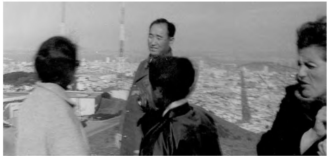
True Father at the Twin Peaks Holy Ground in San Francisco

January 28, 1965 True Father Begins First World Tour