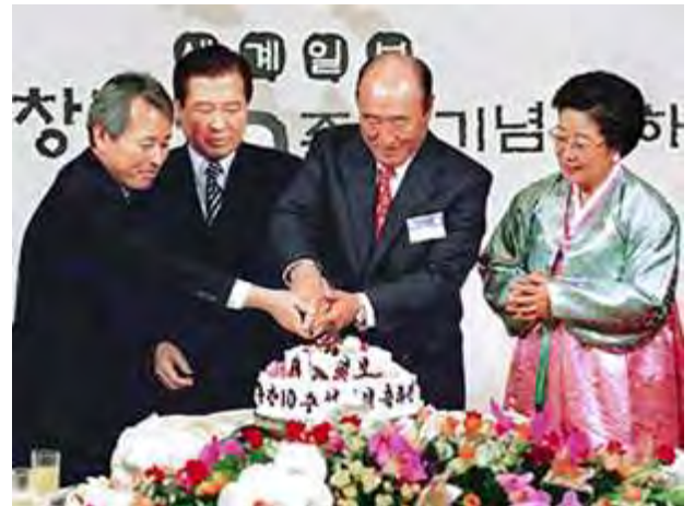
True Father founded the Segye ("universal") Times to be the "window on the world" for the Korean people.

In 1988, following South Korean President Roh Tae-woo's declaration of greater freedom and the Seoul Olympics, the number of newspapers in Korea doubled. True Father founded the Segye ("universal") Times. He intended it to be the "window on the world" for the Korean people. According to True Father: