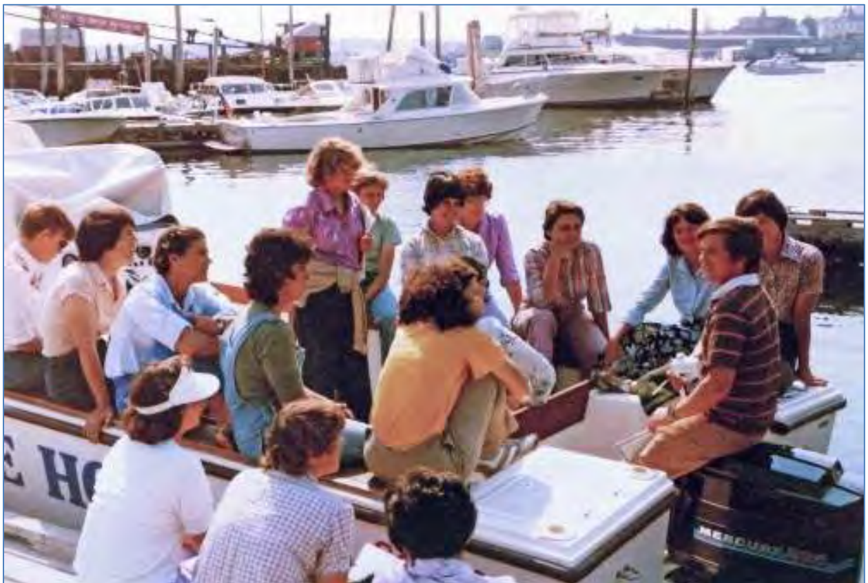
The fleet engineer gives a lecture on the outboard operation and maintenance to the sisters who are preparing for the all-sisters boat.

The hardest job was selecting the four sisters to be on the all-sister's boat. All of them had good qualities, but none was skilled in all aspects. I had to put together a team that would cover all the bases. One was a good navigator, and another understood the gear. The third was a black belt in tae kwon do and had the strength to handle a tuna. The captain, however, wasn't the best in any of these skills. What she was endowed with was a mother's heart. The key to the success of this boat would be teamwork, and the captain must be able to bring the individuals together into one cohesive unit. Only a mother's heart could accomplish that.