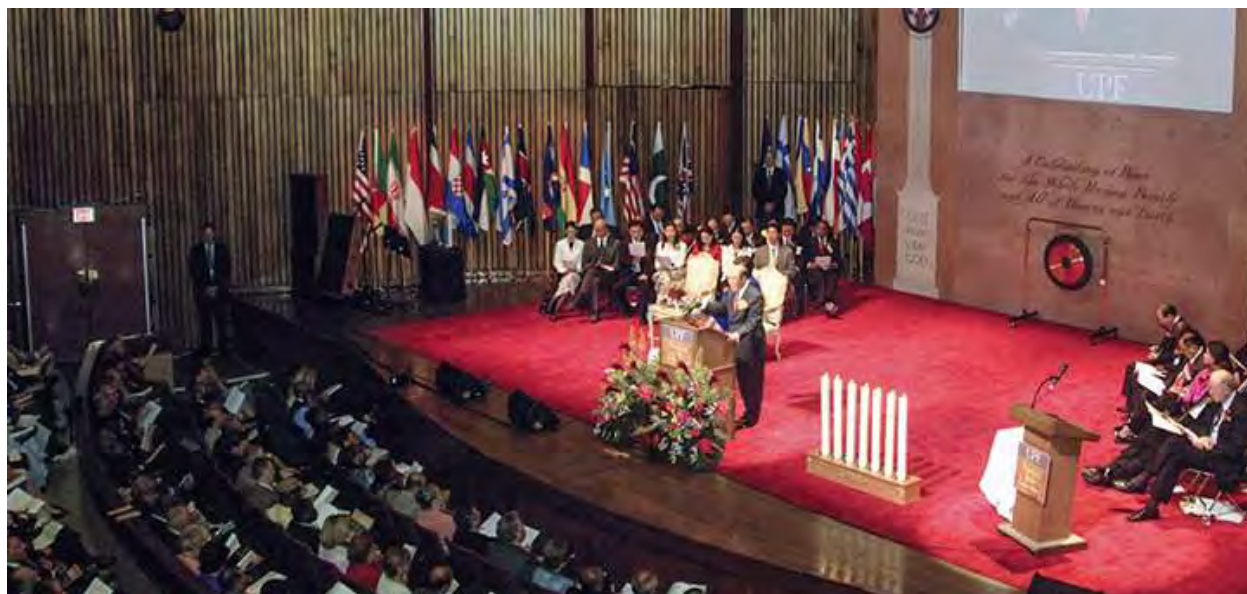
True Father speaks at the inauguration of the Universal Peace Federation on September 12, 2005

True Father established the Universal Peace Federation (UPF) on September 12, 2005, prior to the United Nations' 60th anniversary. Its inaugural convocation was held before 376 delegates from 157 nations at Lincoln Center's Alice Tully Hall in New York. Its mission, True Father declared, was "to renew the existing United Nations and provide a new level of leadership as an 'Abel-type' United Nations." As part of the launch, he also proposed a "World Peace King Bridge Tunnel" to "build a passage for transport across the Bering Strait."