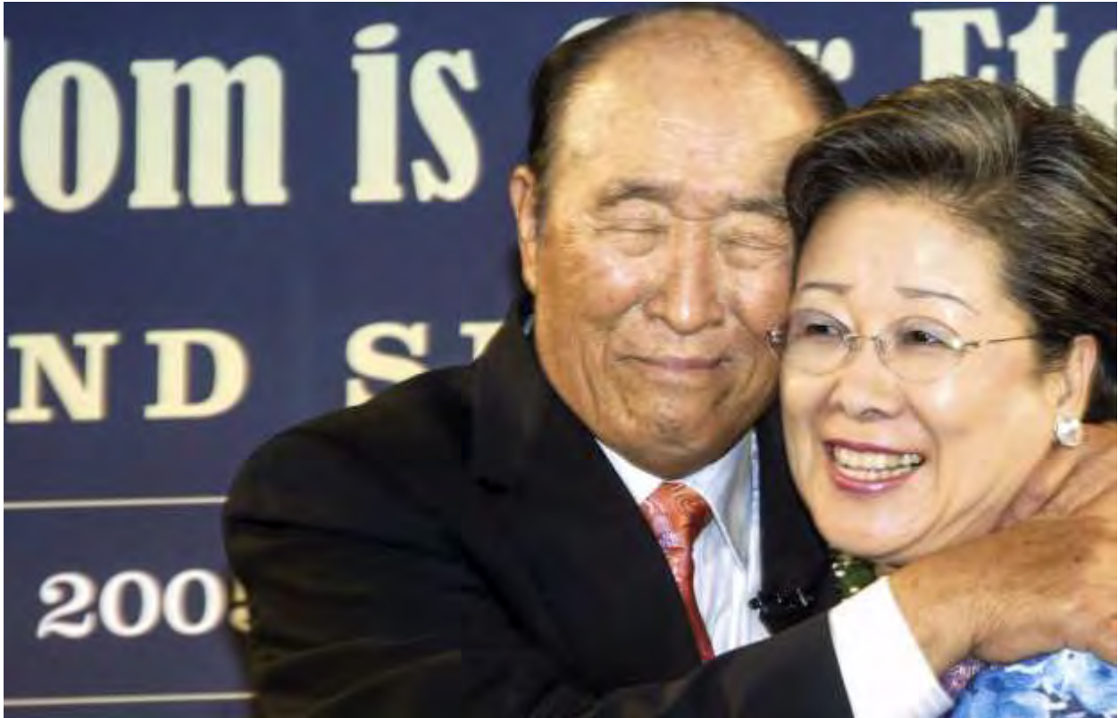
True Parents at the inauguration of the Universal Peace Federation on September 12, 2005