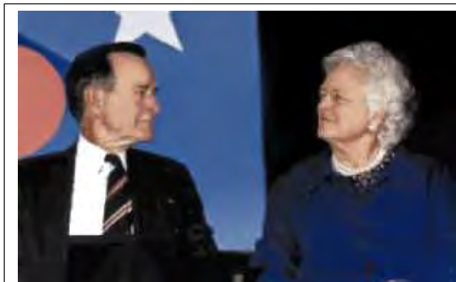
Former U.S. President and First Lady George and Barbara Bush attend a WFWP conference.

True Mother Tours Japan with President and Mrs. George H.W. Bush