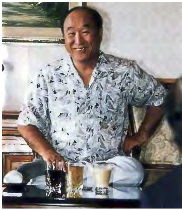
True Father welcomes the representatives of 120 nations to his home in Korea for the Seoul Olympics

The Games of the XXIV Olympiad took place from September 17 to October 2, 1988, in Seoul. The “Seoul Olympics” were significant not only for Korea as the second Asian nation to host the Olympic Games but also for the world, as the games brought together athletes from the communist and free-world nations for the first time since 1976. These also were the last Olympic Games for the Soviet Union and East Germany, both of which would cease to exist by the time of the next Olympic Games in 1992. True Father recognized this and made a special effort to welcome Eastern Bloc and Soviet athletes, providing them with generous gifts and invitations to cultural events. Although Coca-Cola was the official soft drink of the Games, athletes, friends and officials of many nations accepted more than 40,000 cans of McCol and bottles of Ginseng-Up. Following the completion of the Games, True Father proposed the holding of a World Festival of Culture (later designated as the World Culture and Sports Festival) as an “internal” complement to the Olympic Games.