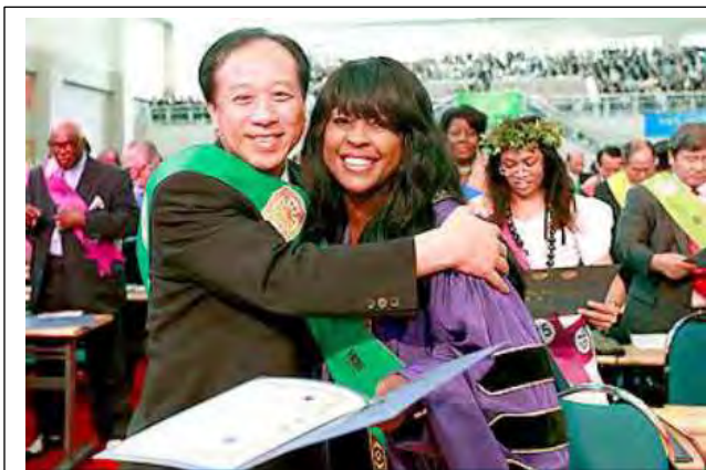
Ministers of different faiths and backgrounds embrace after receiving honorary Korean surnames

True Parents conducted a grand ceremony in the Cheongshim Peace World Center for the bestowal of Korean surnames upon 172 ministers, 43 each from the North, South, East and West quadrants of the United States. They came to Korea representing America, Christendom and the entire world, with the purpose of registering in God's Kingdom and testifying that God had anointed True Father. The clergy, who understood and supported True Parents' historic mission from the point of view of 77 different religious denominations, were united through a singular cause. By joining into and becoming part of a Korean family and exchanging names, they gave a powerful