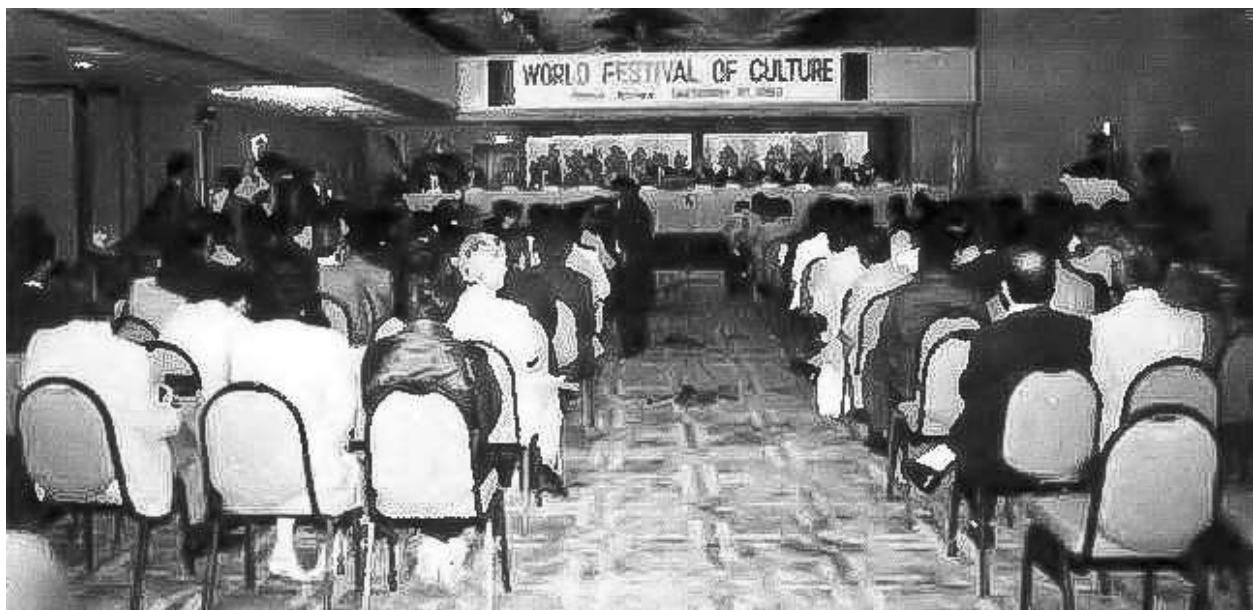
The press conference announcing the World Festival of Culture