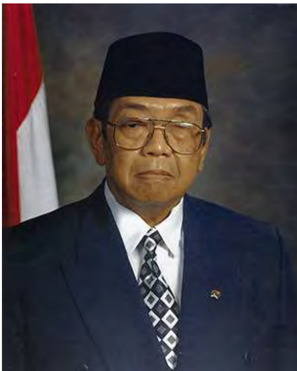
Former President of Indonesia, Abdurrahman Wahid, met with True Father at the World Summit of Muslim Leaders

A little more than a month after the tragic events of 9/11, True Father hosted Assembly 2001, "Global Violence: Crisis and Hope," in New York City from October 19 to 22, 2001. It convened 380 political and religious leaders from 101 nations. During the conference, True Father met with Abdurrahman Wahid, the former president of Indonesia and longtime head of the Nahdlatul Ulama, the largest independent Muslim organization in the world. True Father also met with Nation of Islam leader Minister Louis Farrakhan and urged the two to work together. A month later at a breakfast meeting with Unificationist leaders, True Father suddenly insisted, "Muslims should hold a peace meeting before the end of the year. Ask H.E. Wahid and Minister Farrakhan if they will convene such a conference. I will help if needed." Dr. Frank Kaufmann reported, "Within 22 days, 180 Muslim leaders from 51 countries sat in the ballroom of the newly opened JW Marriott Jakarta to welcome speakers for the opening plenary of the World Summit of Muslim Leaders discussing Islam and a future world of peace." Minister Farrakhan and H.E. Wahid acted as co-conveners ably supported by IRFWP staff. Amid the confusion and