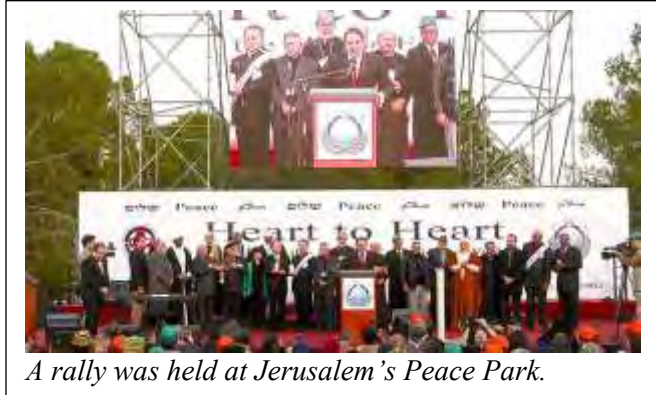
A rally was held at Jerusalem's Peace Park.

True Parents set important conditions, centered on the American Clergy Leadership Conference (ACLC), for the reconciliation of the Abrahamic faith traditions of Judaism, Christianity and Islam. In 2003, True Father called upon Christian clergy to “exchange the cross for a crown” as a foundation for traveling to the Holy Land and reconciling with their Jewish brethren. Some 131 members of the clergy did so and went to Jerusalem, where they met a like number of Israeli rabbis and jointly signed the Jerusalem Declaration, which