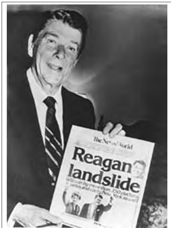
Ronald Reagan holding a copy of the News World, which predicted Reagan's landslide victory on Election Day morning, November 4, 1980.

After the Washington Monument rally of September 1976, True Father "set the deadline" of December 31 for producing the first issue of a new daily newspaper in New York City. On December 31, "the presses rolled early in the morning ... and the first issue of The News World hit the streets of New York." With a color photograph on the front page and a motto that described it as "New York's oldest daily color newspaper," The News World was a 24-page general-interest daily with a staff of 200. During the New York City blackout of July 1977, it was the only newspaper to publish, with reporters working by candlelight to write and edit stories. Later, during a three-month newspaper strike that shut down the city's other major dailies, The News World continued to publish, with its circulation soaring to nearly 400,000 daily.