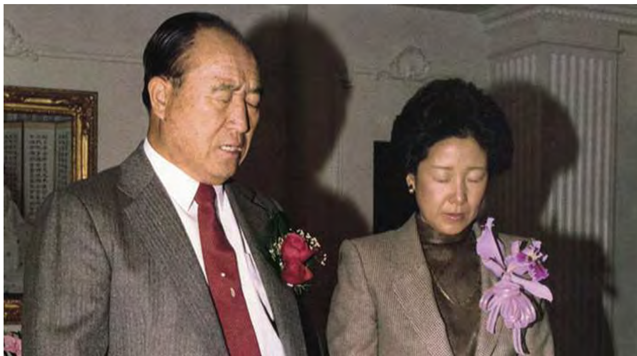
True Parents dedicate the CAUSA International Headquarters.

True Father set up CAUSA, from the Latin word for “cause,” in 1980 following the fall of Nicaragua in 1979 to Marxist Sandinistas. The overwhelming success of CAUSA programs in Latin America in ideologically arming students, union leaders, teachers, government officials and police who previously had been exposed to Marxist theory led to CAUSA’s expansion to the United States. In 1983, construction of CAUSA International Headquarters began in the Tiffany Building on Fifth Avenue in New York City. In addition to a main hall equipped with highly advanced multimedia equipment and seating for 200, renovated space included 22 offices. Among these were CAUSA libraries for research, the CAUSA Institute, and multimedia rooms for the preparation of lecture slides and diagrams. True Parents dedicated the facility, cutting a ceremonial ribbon and encouraging staff at a celebration banquet on November 2, 1983. The following year, CAUSA sponsored 34 major conferences and 290 local programs.