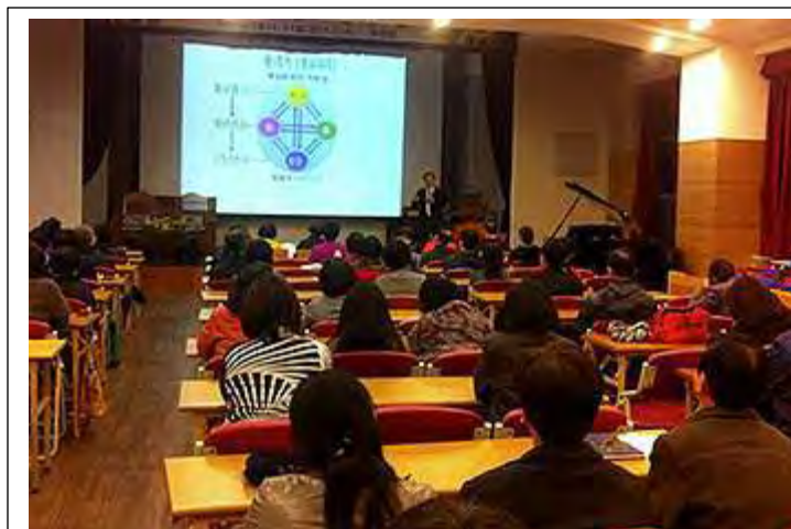
Participants listen to a Divine Principle lecture at the No-won Church during the three-day lecture series on November 2-4, 2012 as part of the first of three 40-day Revival Campaigns.

Scores of churches across Korea launched a Nationwide Divine Principle Revival Campaign on November 2, 2012. FFWPU Korea published advertisements for the campaign in 11 national newspapers under the headline “The Time That You Open Your Mind, New Life Will Begin.” The revival was aimed at explaining who Rev. Moon was, what his mission was, and why Unificationists refer to him as “True Father,” the “Messiah,” and the “Second Coming.” Through the three-day lecture series which continued until November 4, it also was intended to answer fundamental questions about the life and destiny of humankind. After the passing of True Father, True Mother called for a revival through witnessing to the Divine