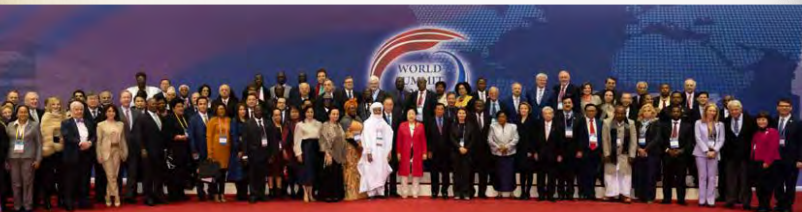
Participants at a World Summit

The World Summit program introduces essential, universal values, principles and practices that are necessary to create a world in which people of every region, race, nationality, culture and religion live together in peace. We consider the root causes of conflict and the ways we can move together from states of conflict, inequality, poverty and enmity toward reconciliation, cooperation and prosperity as one human family under God.