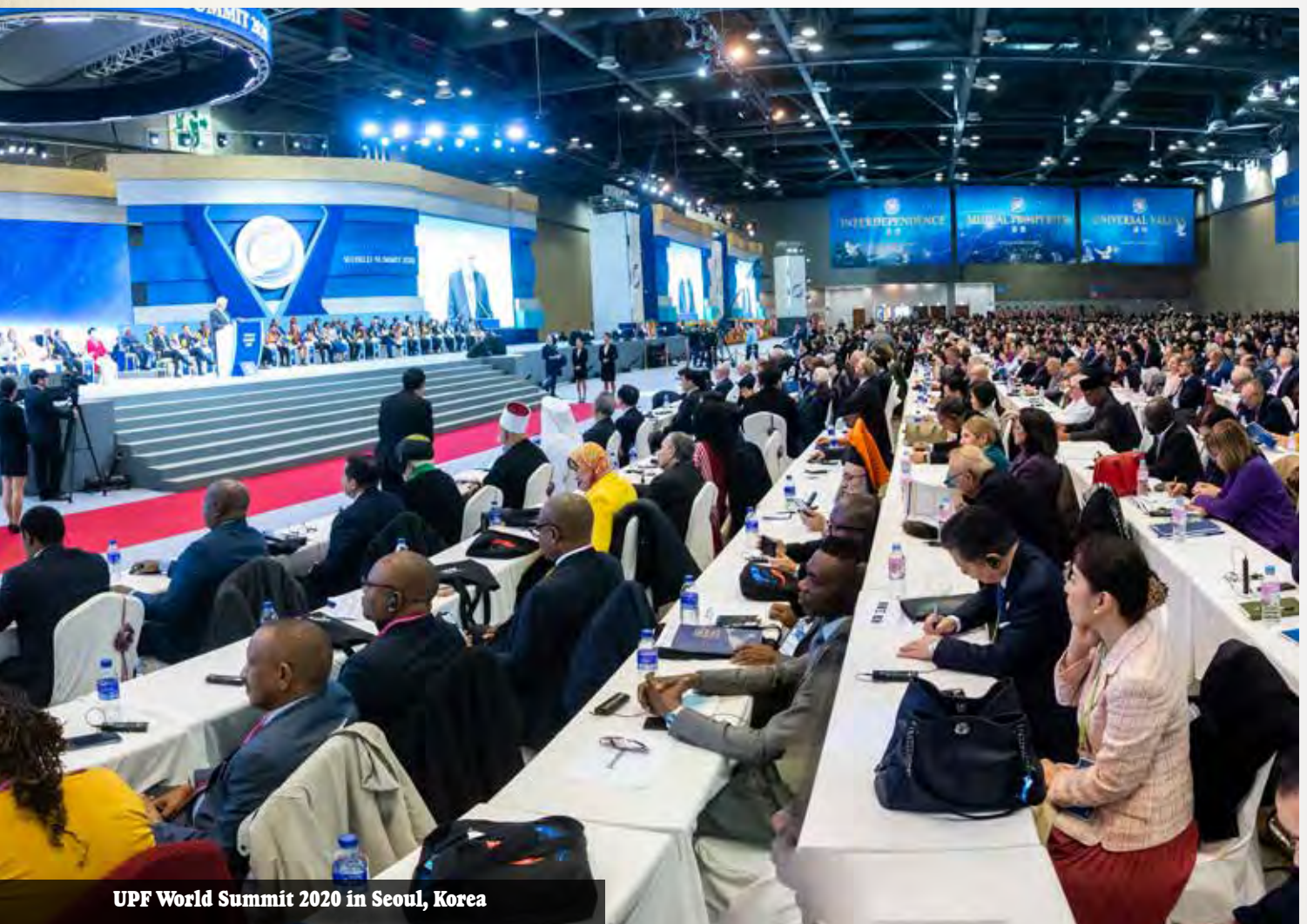
UPF World Summit 2020 in Seoul, Korea

UPF is an NGO in General Consultative Status with the Economic and Social Council of the United Nations. We support and promote the work of the United Nations and the achievement of the Sustainable Development Goals.