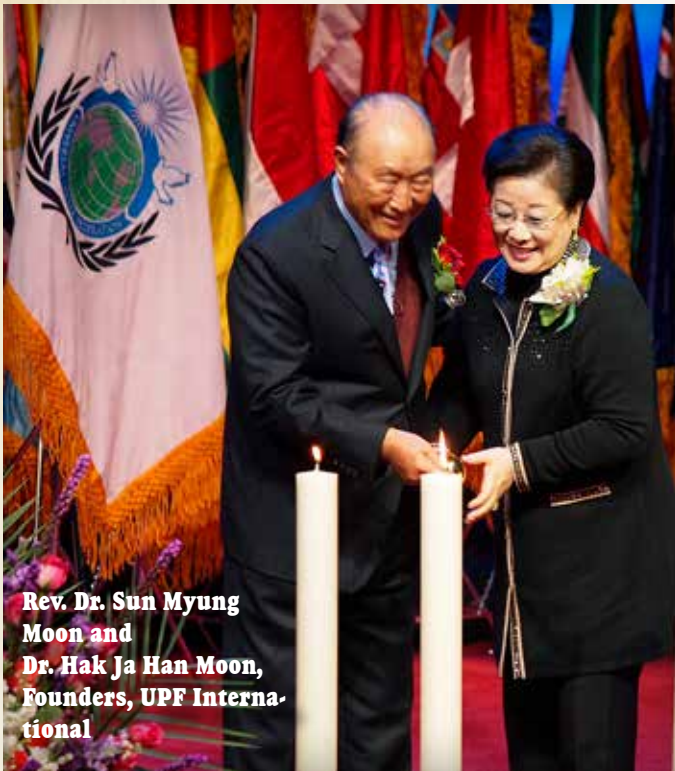
Rev. Dr. Sun Myung Moon and Dr. Hak Ja Han Moon, Founders, UPF International

The Universal Peace Federation (UPF) is a global network of individuals and organizations dedicated to building a world of peace centered on universal spiritual and moral values. UPF and its global network of Ambassadors for Peace bring universal, spiritual principles to the task of resolving conflict and reconciling the divided human family.