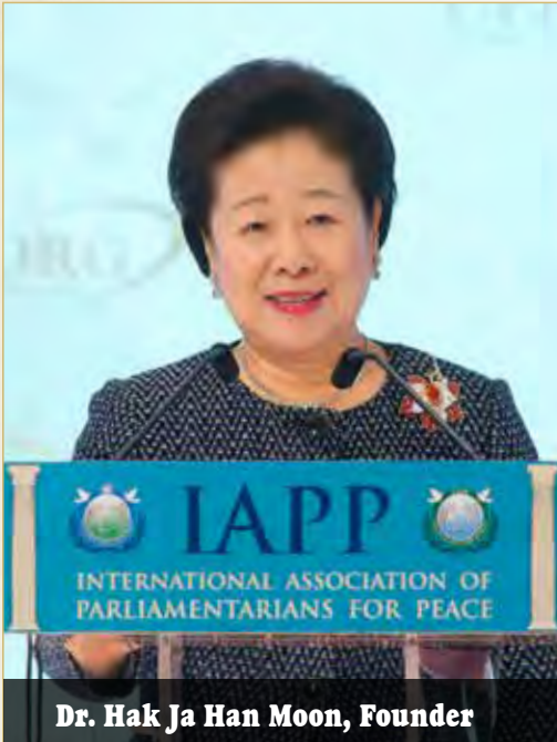
Dr. Hak Ja Han Moon, Founder

WORLD SUMMIT PROGRAMS HAVE BEEN HELD THROUGHOUT THE WORLD, BRINGING TOGETHER THOUSANDS OF LEADERS FROM ALL WALKS OF LIFE