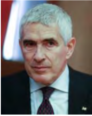
Hon. Pier Ferdinando Casini, Senator; Former President, National Assembly; Honorary Chairman, Interparliamentary Union, Italy

In his keynote speech, Italian Sen. Pier Ferdinando Casini, the former president of the National Assembly and the honorary chairman of the Inter-Parliamentary Union, explained that the issue of Korean reunification is an example of the tension between political pragmatism and utopianism. While politics is rooted in "realism and concreteness," it feeds on utopian dreams like the peaceful reunification of the Korean Peninsula.