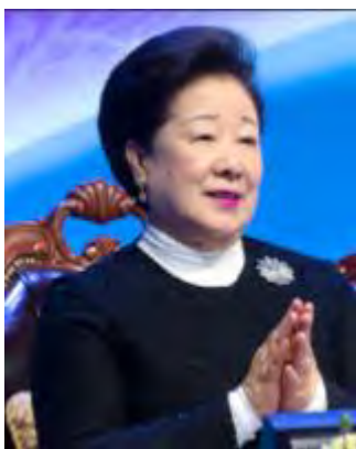
Dr. Hak Ja Han Moon, Co-Founder, Universal Peace Federation