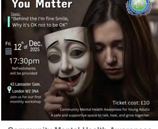
Community Mental Health Awareness