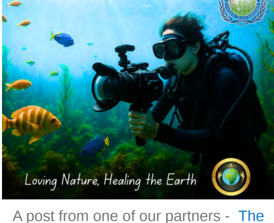
A post from one of our partners - The Earth and I