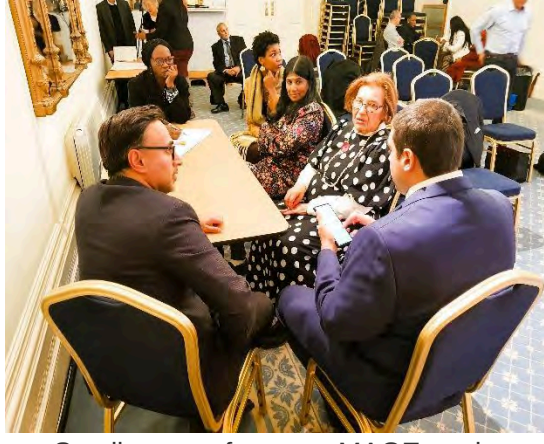
Small groups focus on MAGE goals