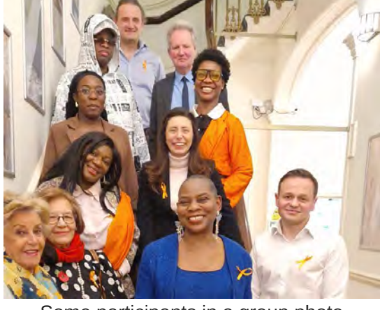
Some participants in a group photo