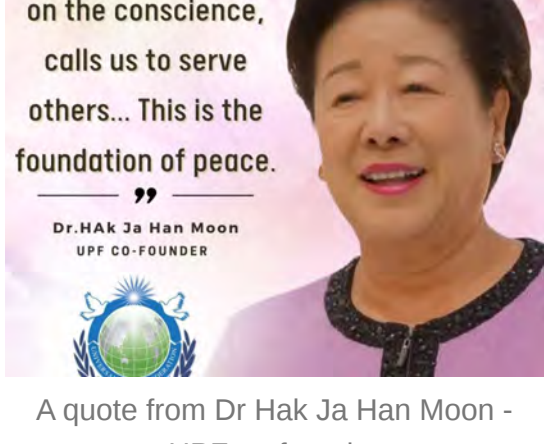
A quote from Dr Hak Ja Han Moon - UPF co-founder