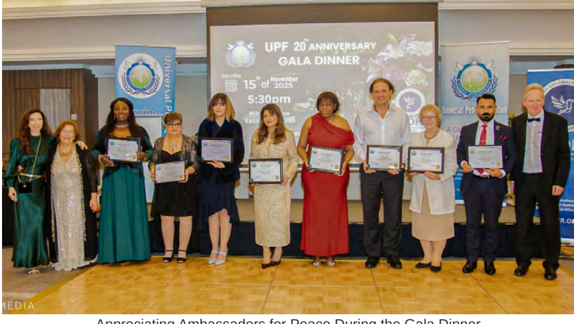
Appreciating Ambassadors for Peace During the Gala Dinner

Across London, USIDHR volunteers and UPF Ambassadors for Peace are already working side by side to deliver awareness sessions, engage with local institutions, and support grassroots initiatives that strengthen communities. Full article here