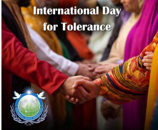
International Day of Tolerance - 16th of November