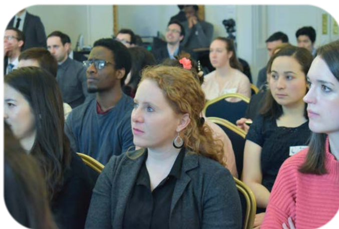
Audience members listening to Keynote speakers