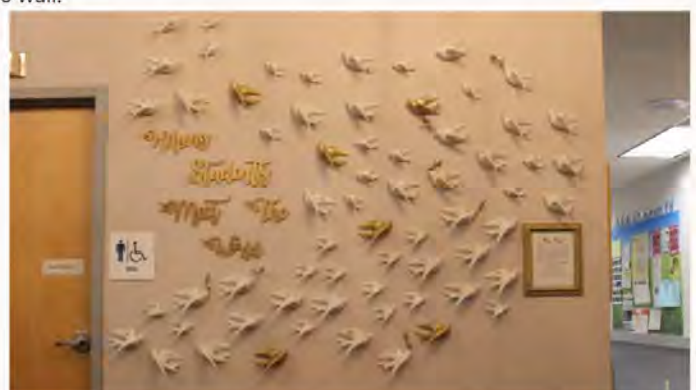
Bronze Level: 50-99 dollars--You will receive a small dove which will be placed on our dove wall located on the front of the school with your name on it.

Throughout our live broadcast, our student MC's will recognize every donor that contributes to our mission (unless they specify to remain anonymous.) Donors who make the following contributions will also be recognized on our dove wall.