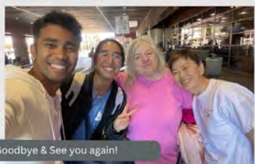
Goodbye & See you again!