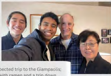
An unexpected trip to the Giampaolis, filled with ramen and a trip down memory lane