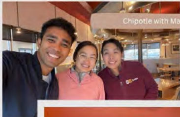
Chipotle with Makikosan!