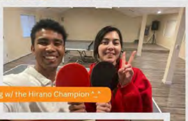
Ping Pong w/ the Hirano Champion ^^