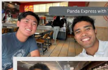
Panda Express with Tatsu!