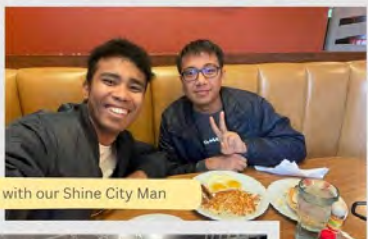
Breakfast with our Shine City Man