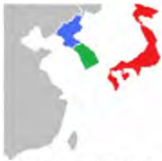
North and South Korea and Japan. Public domain image. Cropped

arriving as a stowaway on a South Korean boat under cover of darkness and was tortured severely by the Japanese police when discovered. Only on the third such attempt did he succeed.