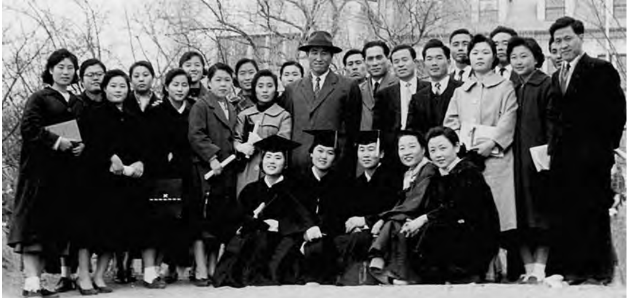
Father Moon, in the middle with hat, with students expelled from Ehwa Women's University and Yonsei University in 1955

From the autumn of 1954, the number of members grew rapidly. This growth was noticed by Christian leaders in Seoul. They began to see the Unification Church as a competitor, to which they were afraid of losing members.