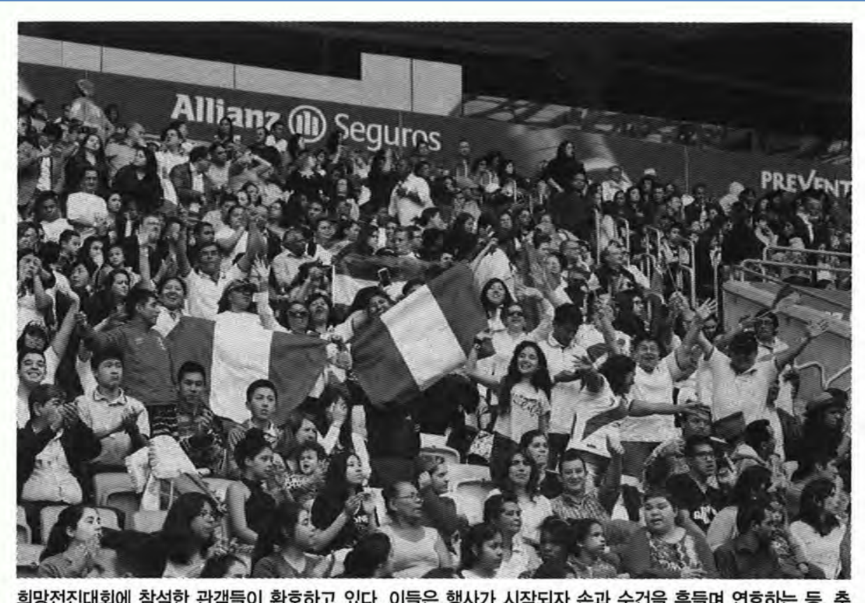
희망전진대회에 참석한 관객들이 환호하고 있다. 이들은 행사가 시작되자 손과 수건을 흔들며 연호하는 등, 축 제를 즐기러 온 분위기였다.

What are the truths in her sermon? World unification can be achieved when we overcome religious disputes and ideological conflicts. True peace can be realized when all nations of the world harmonize and communicate like one family. Aren't they the 'universal values?'"