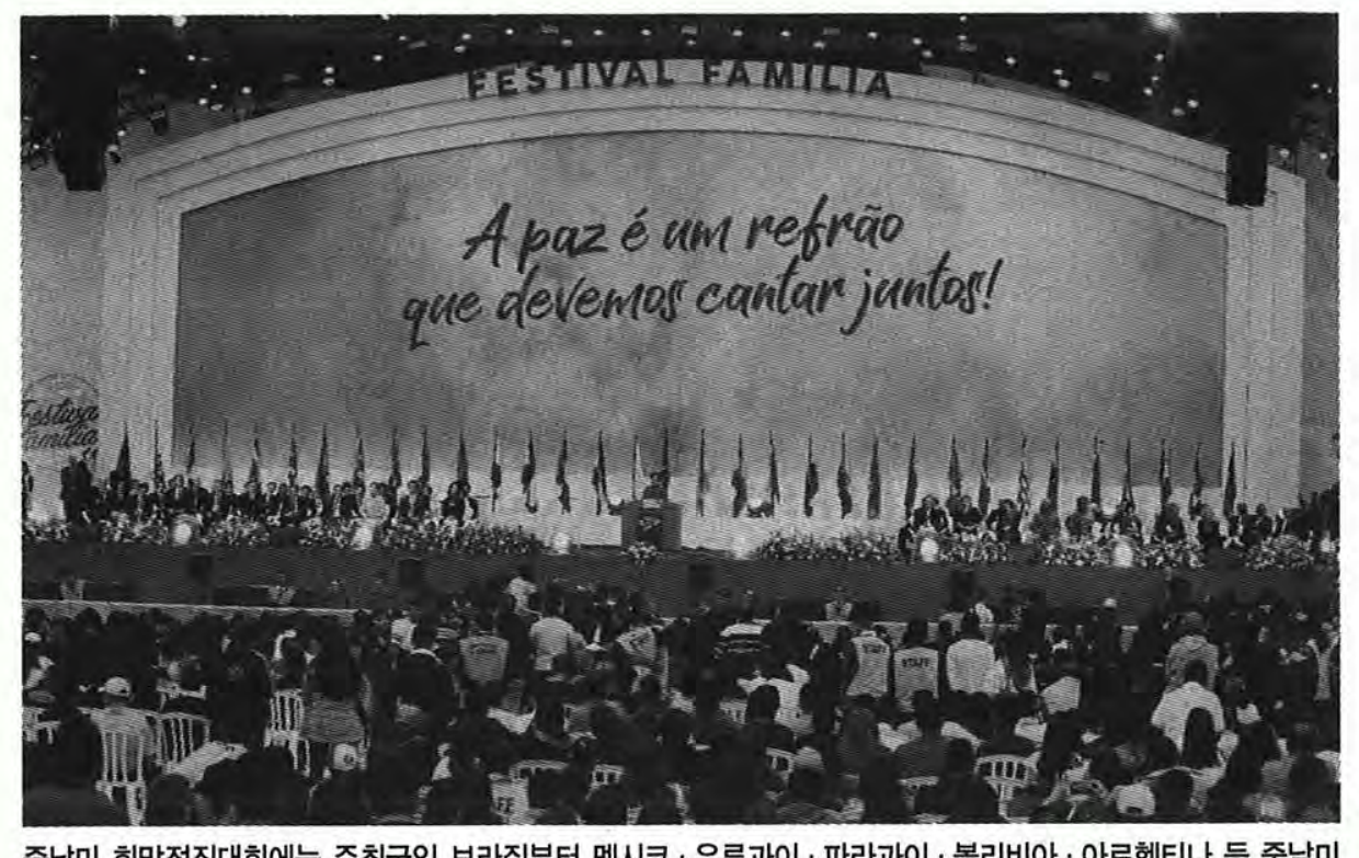
중남미 희망전진대회에는 주최국인 브라질부터 멕시코 · 우루과이 · 파라과이 · 볼리비아 · 아르헨티나 등 중남미 를 비롯해, 41개국 정치 · 종교 · 여성 지도자들과 세계 신도를 포함 총 3만명이 참석했다.

"Latin America is plagued with ongoing conflicts such as corruption, national border disputes, drugs, family breakdown, single-parent families and gender identity crises. I believe these issues can be solved if each nation devotes more attention toward restoring the value of the family through this Family Festival (Rally for the Hopeful March Forward for the Providence in Latin America). The FFWPU is running organizations for the future generation under the teaching of 'Hyojeong.' They are the Collegiate Association 'CARP' and UPF's Youth and Student for Peace. The two organizations are taking the lead in the pure love movement, as well as the prevention of deviation, so that the young people can grow upright. We have also launched the Sunhak Scholarship Foundation to cultivate future human resources.