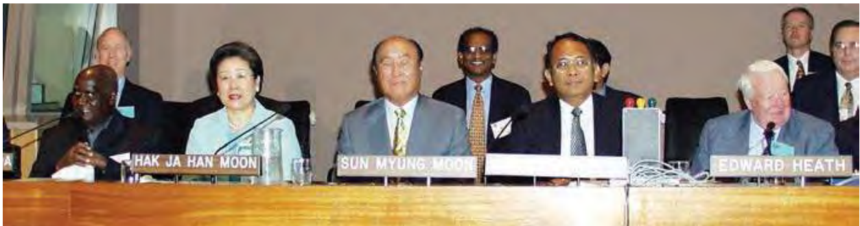
Then President Kaunda (left) with True Parents at the UN during UPF's conference on Governance and the Role of Religion in Peace and Security on August 18, 2000

Rev. Moon dedicated a lifetime to a message. He did this against great odds. The greatest of the world powers opposed him. But the message continued because it is a message that was anointed. It is a message that echoes deep in the human psyche. It is a message about the most basic unit of human life, the family. It tells the world the truth, about our nature and about what we must do if we are to have true peace in the family, in the community and between nations.