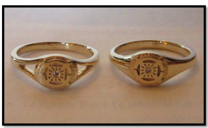
"7 mm" Cut Out Style Cut Out: $300 Solid: $320

To confirm your order, please email Michael Brunkhorst at <a href="mailto:mcbrunk@verizon.net">mcbrunk@verizon.net</a> with your: