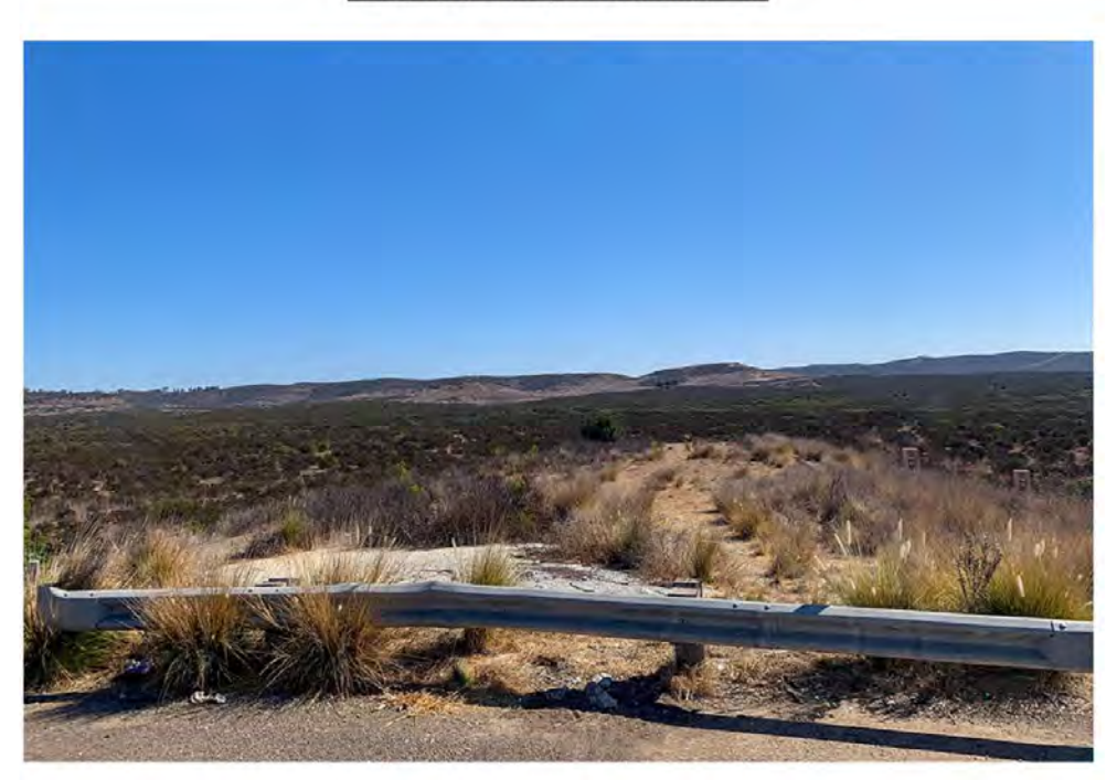
A short 15 minute drive from downtown San Diego. Closer to downtown than Scripps Ranch, Mira Mesa, and Del Mar.