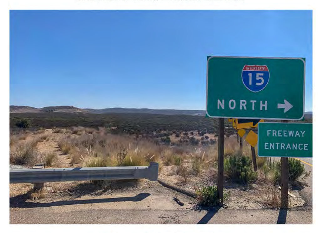
A short 15 minute drive from downtown San Diego. Closer to downtown than Scripps Ranch, Mira Mesa, and Del Mar.