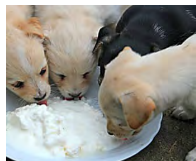
If Your Dog Eats Grass (Do