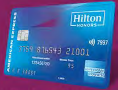
Hilton Honors Card