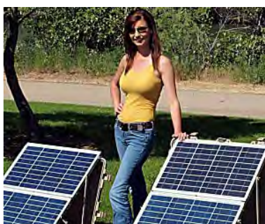
Colorado Program Giving