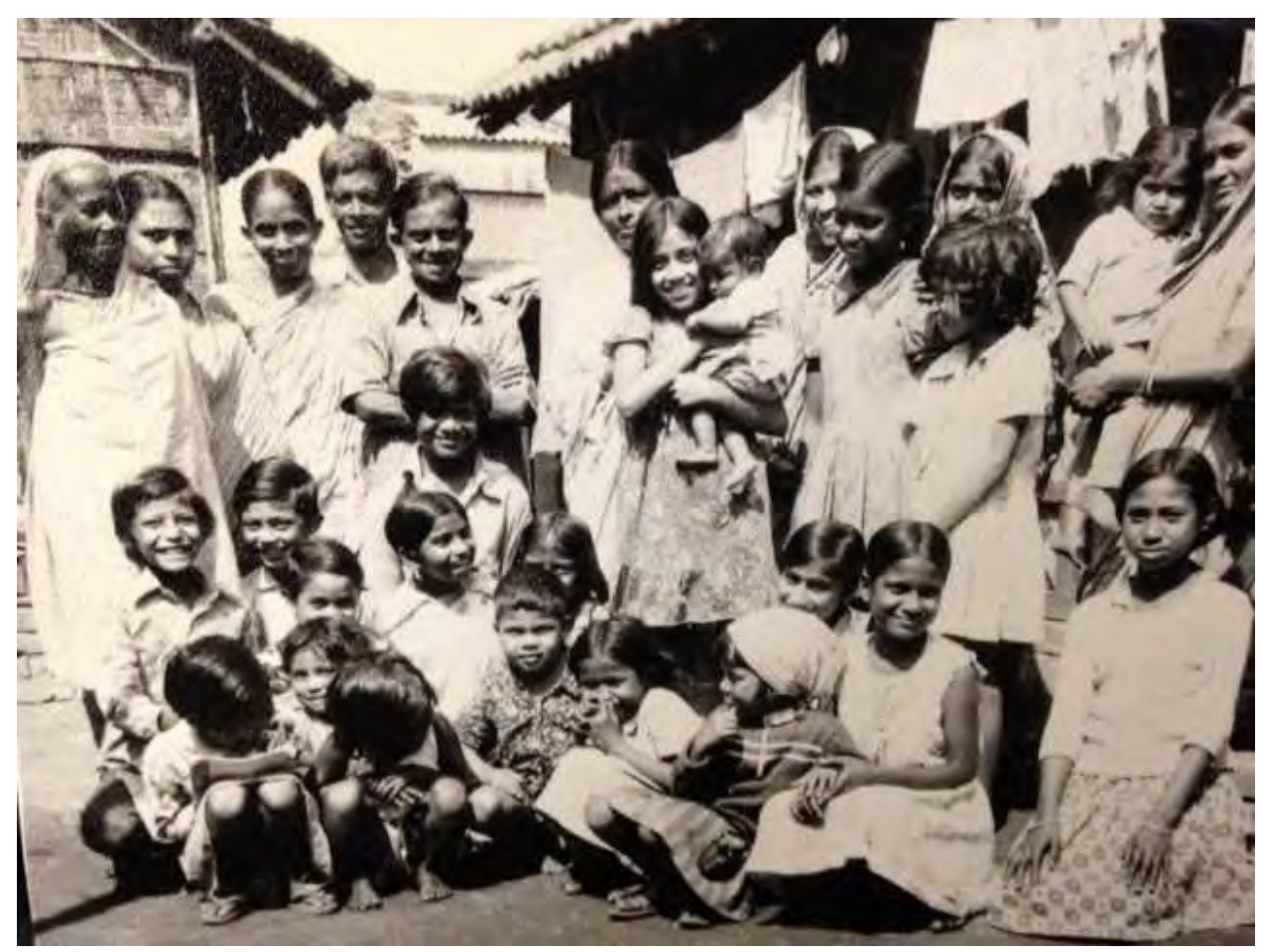
Children from Anandaloy and their parents & families

These were dark days. One night, after an intense argument, I decided to stay in a hotel just to get away from the confusion. As it turned out, that was the very night that the soccer great, Pele, was in town, and there were no rooms anywhere, for any price!