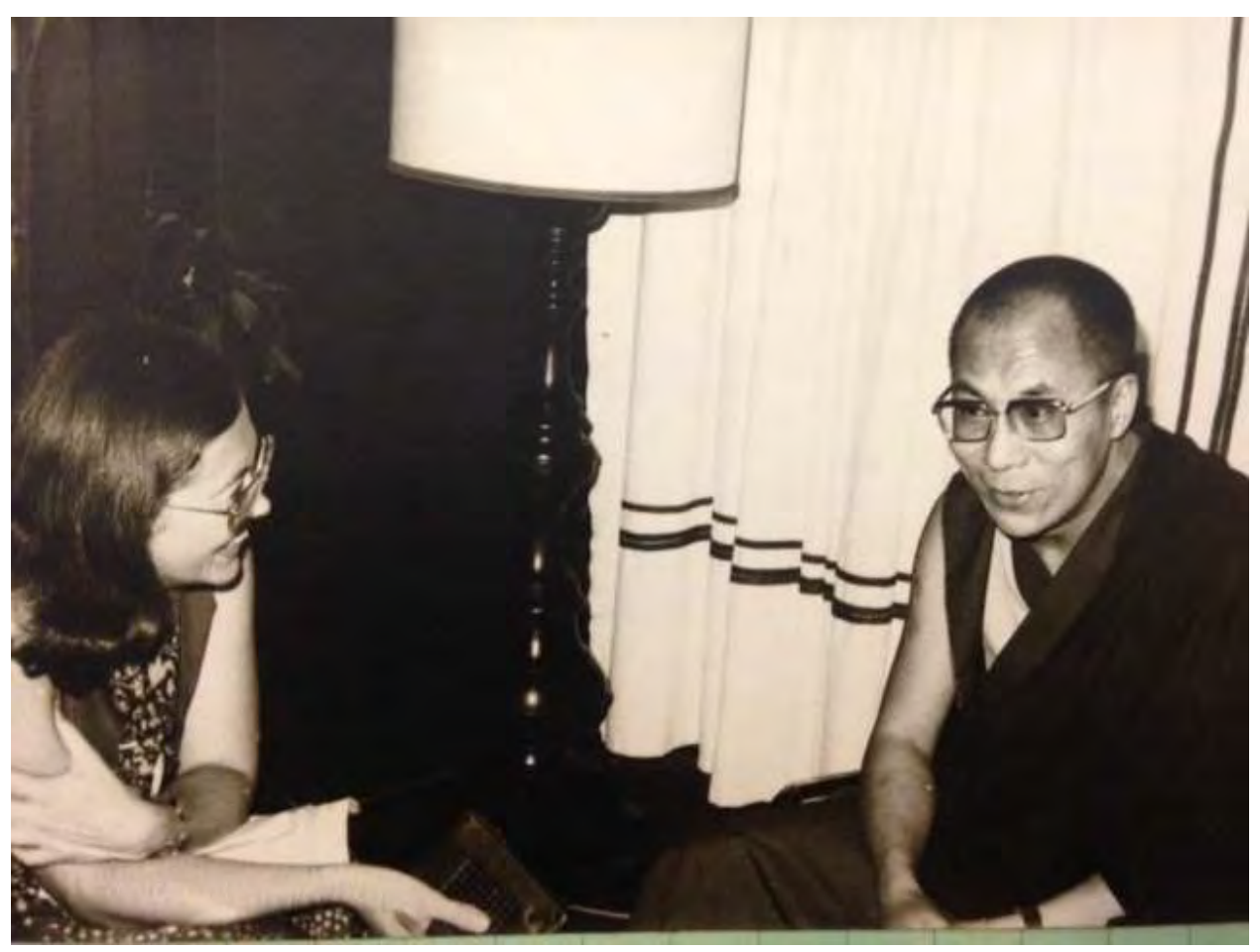
Sara interviewing the Dalai Lama in Greece

across the street were at work before we woke up. We rushed to get to government offices before they closed at 1 pm, then wandered the empty streets as people slept during the afternoon. But it was the evenings that are most memorable. Tavernas were everywhere. Plaka, where music from one place competes with music from another, is for tourists. Greek residents go to more humble, remote gardens where the music is a quieter. A soft breeze, nice music, good company -- I came to enjoy the Greek lifestyle. Music and dance is as much a part of Greece as the beautiful blue sky and whitewashed buildings that show off bright, red flowers.