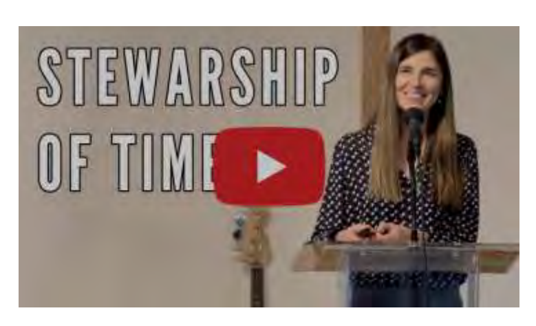
THIS WEEK'S ANNOUNCEMENTS