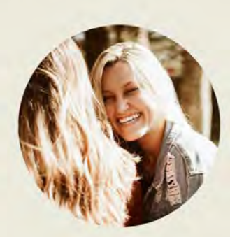
Openness as a Lifestyle