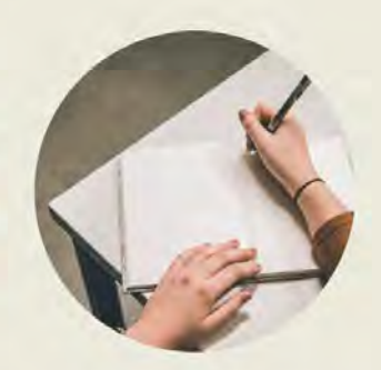
Northstar Goal for Families