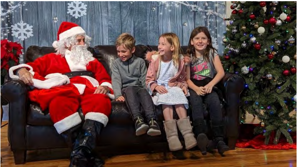
Here are some photos from last week's Christmas Party. A huge thank you to all the volunteers who