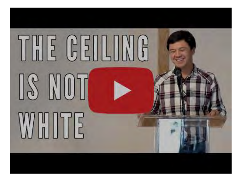
This Week's Announcements