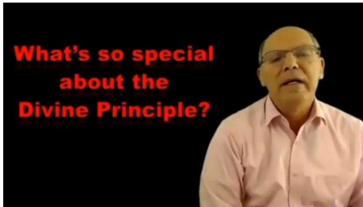
Caption: WHAT'S SO SPECIAL ABOUT THE DIVINE PRINCIPLE?

One of the reasons that we have this kind of situation is that times have changed; and, in my father's lifetime and before that, many generations, when you had a difficulty in your life, with your marriage, with your family, with your finances, with your teenagers, whatever it was, you went to find the highest building in town, which was the steeple of the church. You talked to the pastor, the priest, the rabbi, the imam; because, they were considered the wisest, most knowledgeable, educated, informed people in town. They were the experts.