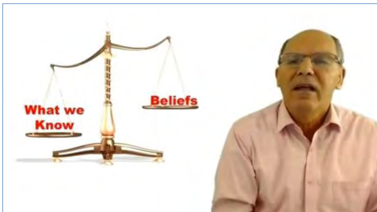
Caption: (the weight of) WHAT WE KNOW vs. BELIEFS

they tried to come up with answers to our situations without God. That is what most philosophers and social scientists do.