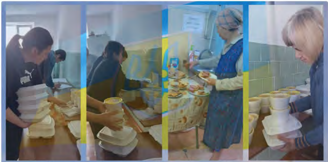
Out of respect for people fleeing the war, IRFF Moldova took no pictures of anyone receiving this aid.

With the help of our partner IRFF UK, Impact Foods found out that there was a possibility to work with IRFF in Moldova, which borders Ukraine. Through a series of meetings, Impact Foods and IRFF Moldova have managed to put together three projects serving over 6,000 meals to families fleeing the war in Ukraine. At the end of the projects, we were surprised but also very honoured to receive a letter from the Mayor of Balti City acknowledging our support for the crisis.