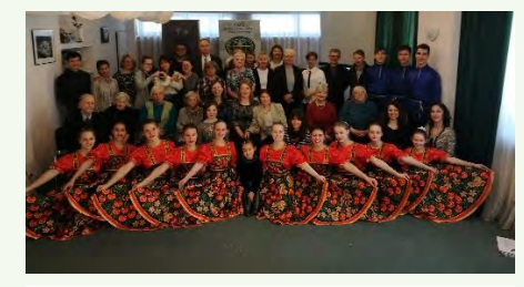
After the concert during the Bridge of Peace Poland-Russia 2018