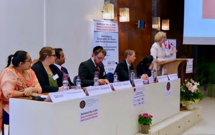
We-the\ members\ of\ the\ IRY-C-would\ like\ to\ appeal\ to\ the\ leaders\ of\ this\ world,\ whatever\ their\ field\ of\ influence\ may\ be,\ to\ consider\ the\ following\ principles.

Projects to support young and growing families are never a waste of resources and money. They provide an invaluable environment for character education and form the bases of our society. The ever-growing class of working poor in western society are symptomatic for dysfunctional elements in our society that evaluates financial profit for the few more than financial stability for the many.