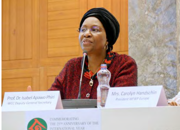
Panel on War and Crisis Zones: Maintaining Familial Resilience