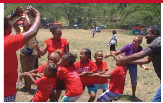
Children working hard at joint sports festival