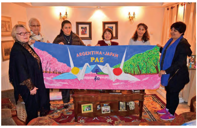
Youths in Sapporo City drew the picture on peace between Argentina and Japan