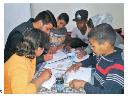
Free mathematics class