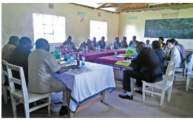
Board meeting with new headmaster