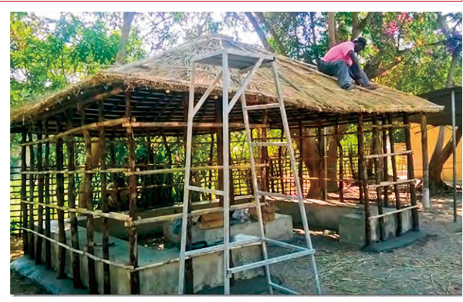
Renovation of arbor

Since the opening of the high school, the number of students who aim at university has increased and the school has produced many matriculates every year. In addition, some graduates have been selected as government-sponsored students to study abroad, including a university in Malaysia.