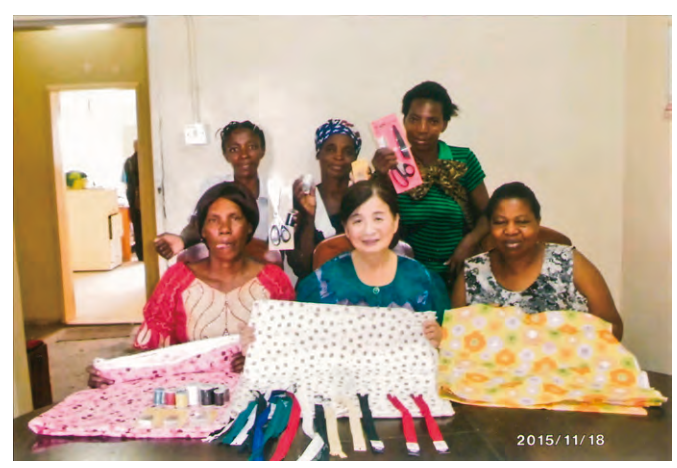
A Japanese supermarket donates sewing tools and fabrics every year