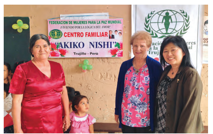
Name of FC is named after Japanese supporters

Trujillo City The branch director requested that the members would like to receive something they can keep rather than a cake as twice a year gifts. From Mother's Day in 2016, gifts have been changed to goods such as small flower vases.