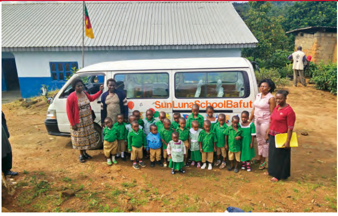
Installed a school bus

At the training center, technical instruction for quilting called the "UNIQUILTS" project is being operated.