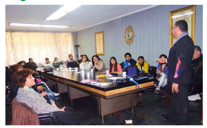
Seminar for university students

Outline: At the universities and public facilities where WFWP started to hold seminars on education for sound development of youths and emotional education in March 2013 and had held them, WFWP added AIDS prevention and character education to the contents of the seminar. Since 2016, focusing on communities and schools in Tucuman Province, Buenos Aires City and Buenos Aires Province, WFWP has promoted only AIDS prevention and character education.