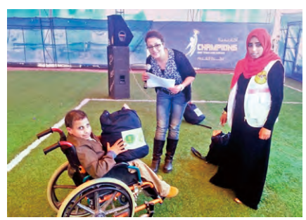
Gifts from WFWP