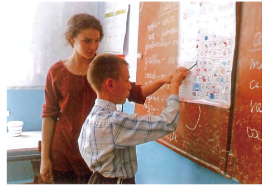
A graduate who is teaching Japanese

Moreover, every school has children who cannot afford clothing, underwear, educational materials, nor even meals. Some are as deprived as orphans, but cannot enter an orphanage for protection because their parents are alive. Urged by local educators and scholars, in 2001 WFWP established a Childers's Day-Care Center at the Cazanesti public elementary and junior high school in the village of Cazanesti, Telenesti District, in order to help children at compulsory education age (up to 15 years old) from becoming victims. WFWP borrow some classrooms, a play room, and a dining hall of the school for free and use this as the Center. The Center supplies needy children with clothing, underwear and school materials to send them to school, feeds them after school, and provides them with a place to do homework, make handicrafts, sing and play. Thirty children come to the Center daily where six staff members including counselors take care of them. Motivation for studying among the children has progressed remarkably. They are proud of the Japanese supporters.