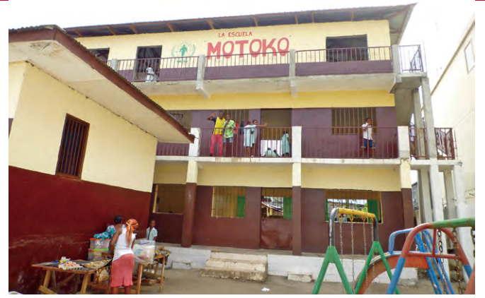
Current school building