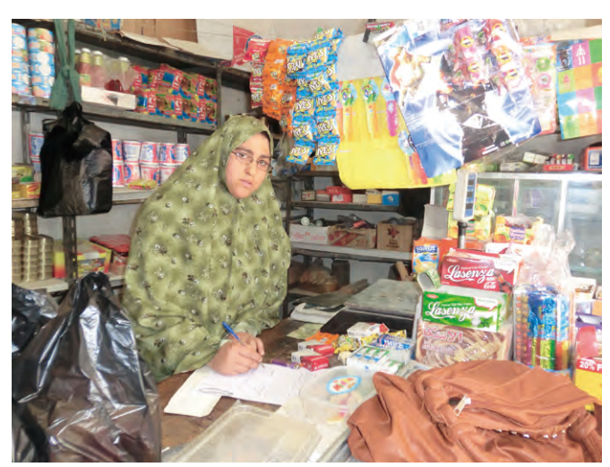
A woman running a grocery store

A total of 41 loans; 1 new and 40 continued. Repayment rate is 100%.