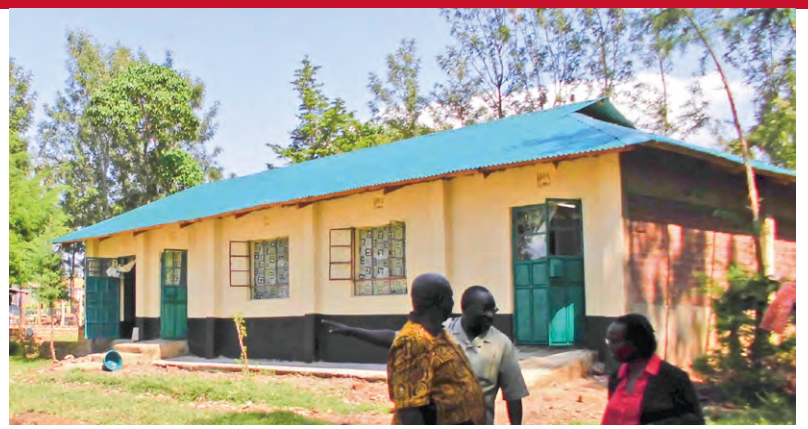
Rebuilt girl's dormitory