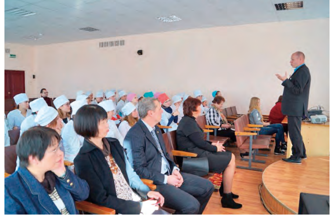
Volunteers attended a seminar at a medical school