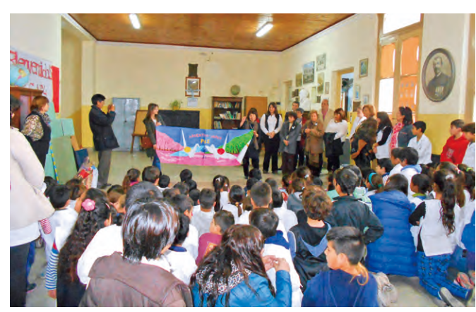
Japanese volunteer showed the picture at an elementary school