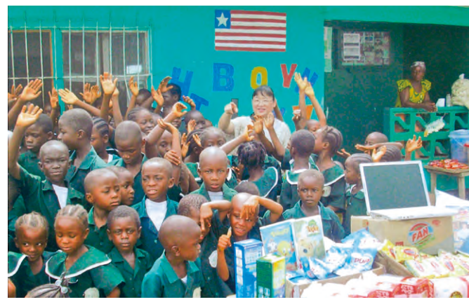
Donation of teaching materials and goods from Japan