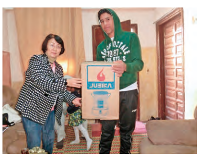
Donated a stove