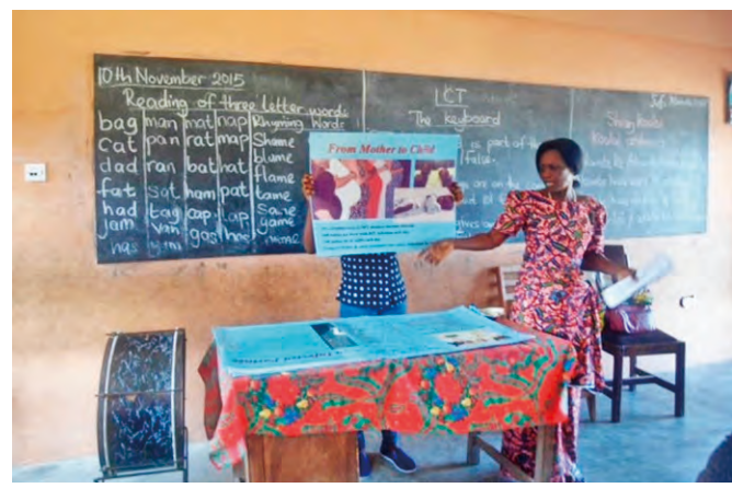
AIDS prevention education using flipcharts