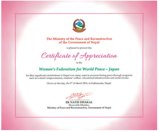
Certification of Appreciation from Minister of Peace and Reconstruction of Nepal