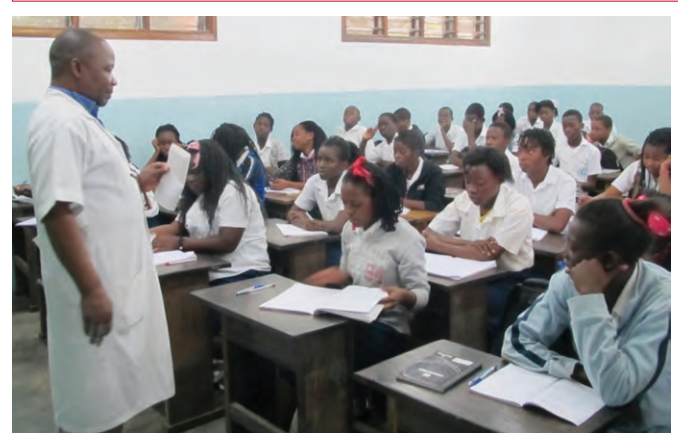
Portuguese class of the 10th grade