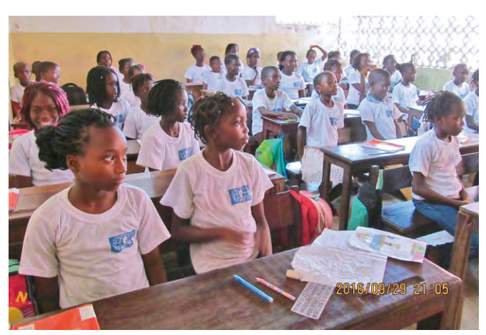
Class of the 4th grade pupils