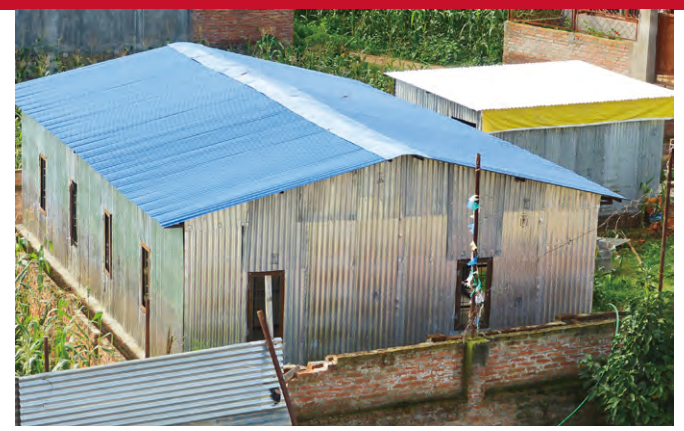
Newly built shelter with donation from WFWP Japan