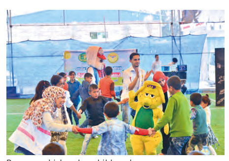
Program which makes children happy

The children spent time pleasantly and were happy because they felt that they were not forgotten during the event. WFWP was gifted a tapestry of thanks by children who participated in the event at later date.