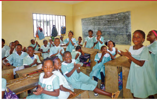
Class of the 4th grade pupils

for junior high school students. In 2016, the school opened a junior high school class which has always been requested from the Minister of Education and parents.