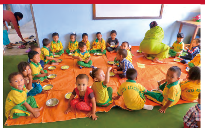
Pre childcare class

WFWP Japan has ended management support as of December 2016 since the school has come to be able to operate on their own. The only support currently continued is the foster parents program for pupils and students.