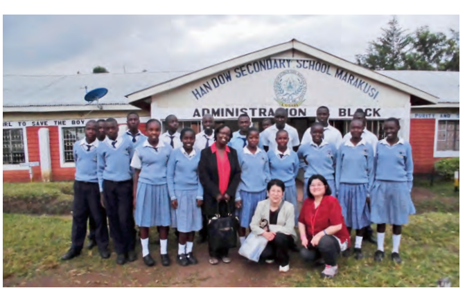
With foster children