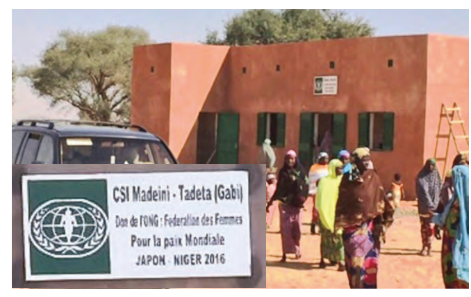
Nameboard of the center with WFWP logo mark

A CS is preferentially built in areas with a radius of 15 km or more from a General Health Center (CSI: Centre de Sante Integre) in which doctors or Senior Registered Nurses stationed. Madeni Tadeta village was preparing to build a CS once as a candidate site in 2004, but it was suspended due to lack of funds. Since the village chief and villagers had requested WFWP enthusiastically to build a CS for a few years, WFWP finally decided to support the funds of its construction in 2016 because there is a merit that it can also be used as a base for mobile clinic activities of WFWP. Securing the planned construction site and preparing for getting approval from the Ministry of Health have already been in place, so they proceeded smoothly. WFWP thought that the village was building a CS at first, but while changing the designs, CS was