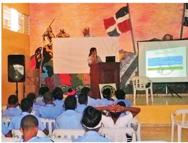
Seminar at the Honduras Junior and Senior High School