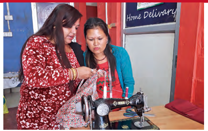
New dressmaking class