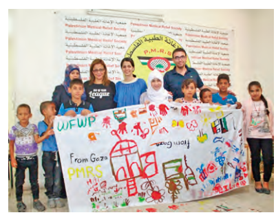
Tapestry of thanks to WFWF