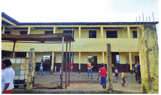
Current school building

WFWP Japan will be supporting the construction of school buildings, maintenance of facilities and attendance of children in poor families.