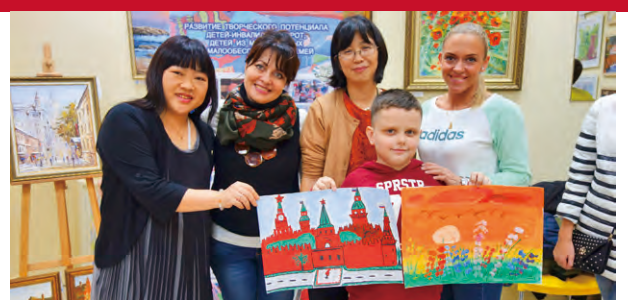
Works of a child