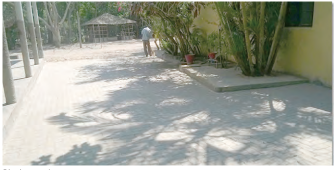
Block paved passage