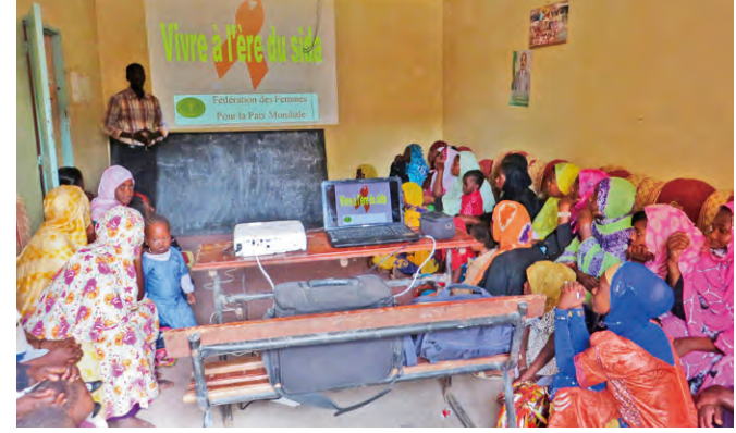
AIDS prevention education for mothers