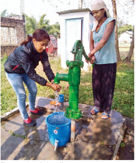
The center installed a well