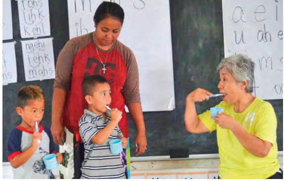
Instructing toothbrushing at the RSP kindergarten

In November, a WFWP Japanese volunteer gave hand-washing instruction to 50 pupils of the Thitsu Elementary School, where many foster children attend. As she gave same instructions before, children remembered the order of the washing hands well. She spoke about check of nails and germs, so children were able to learn about hygiene delightfully.