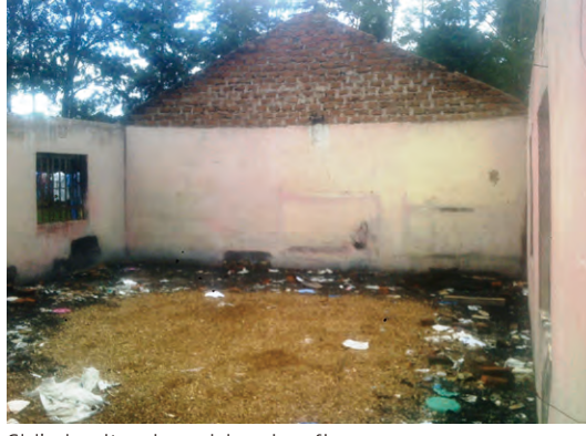
Girl's dormitory burned down by a fire