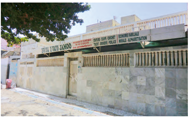
Current school building