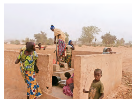
Niger: Well in Madeni Tadeta Village