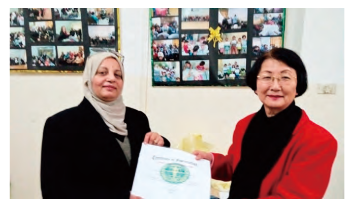
Certification of Appreciation to staff members of center in Wadi Seer