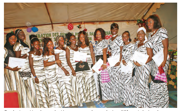
Graduates attend a graduation ceremony by producing different design dresses for each graduation year