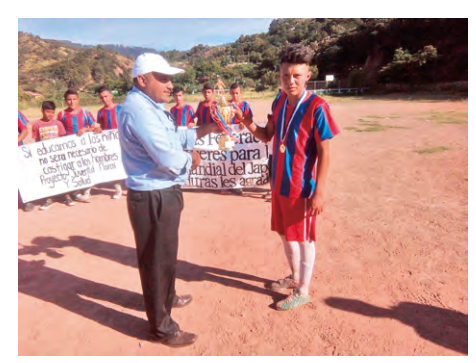
WFWP cup football tournament

In 2001, at Colonia Reparto in Tegucigalpa City, WFWP implemented football and pure love education. That triggered the formation of a youth group in this area. This group has regularly conducted sports events, AIDS prevention and moral education, and community service activities. From 2015, WFWP has supported teaching materials for AIDS prevention education, instructions on AIDS prevention and moral education courses as well as a part of the funds for activities.