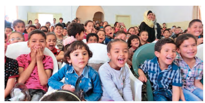
Children enjoying a play

Ten adolescent instructors guided 20 performers (boys and girls aged 12 to 15), and refugee children aged 6 to 10 watched their performances. WFWP educated every participant through all 3 dramas so that they can learn from each other important attitudes and make use of what they learned into real life.