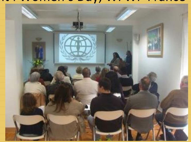
« Conquering True Freedom », WFWP Portugal