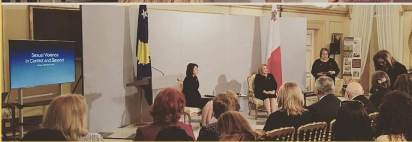
President of Kosovo spoke at Forum on Sexual Violence, WFWP Malta was invited to attend.