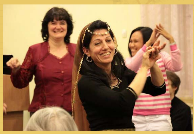
Iranian New Year celebration at Persian Cultural Afternoon, WFWP Hungary