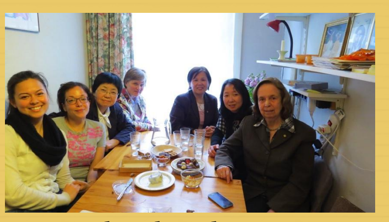
The Women's Peace Academy Netherlands- 24 meetings