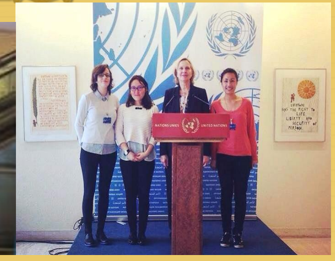
WFWP and UPF intern with former HRC President and during 32 HRC in June