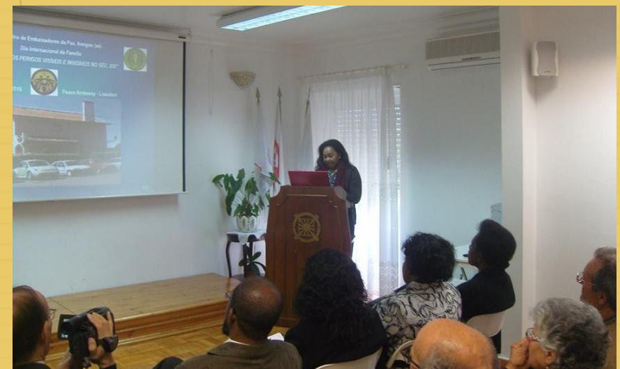
Int'l Day of Families, WFWP Portugal