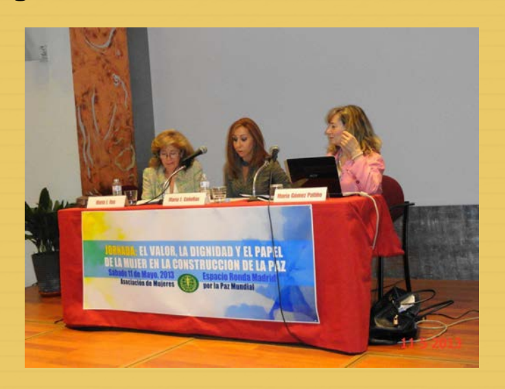
WFWP-Spain at Espace Rondo