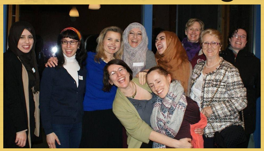
WFWP Ireland, supported a Women's Interfaith Gathering with Sisters of Faith for Peace.