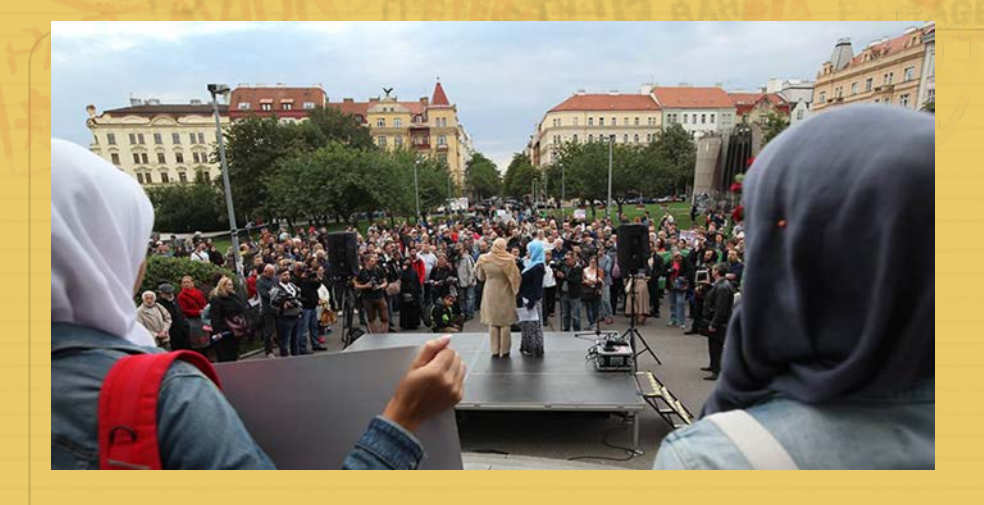
WFWP CZ speaks of TF "Peace Principles" at rally