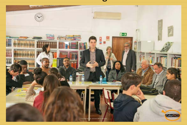
Anti-Racism Event with Students, WFWP Portugal