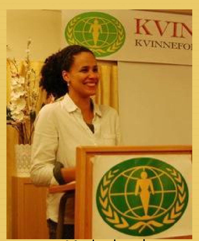
« Motherhood », Int'l Women's Day, WFWP Norway