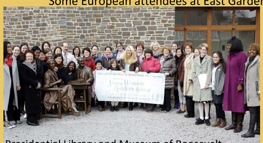
Presidential Library and Museum of Roosevelt