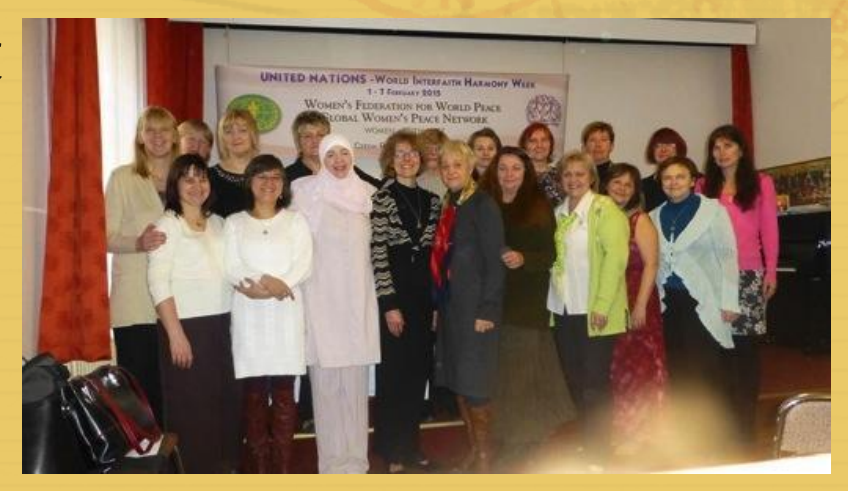
« Women-Faith-Life » Conference, WFWP Czech Republic