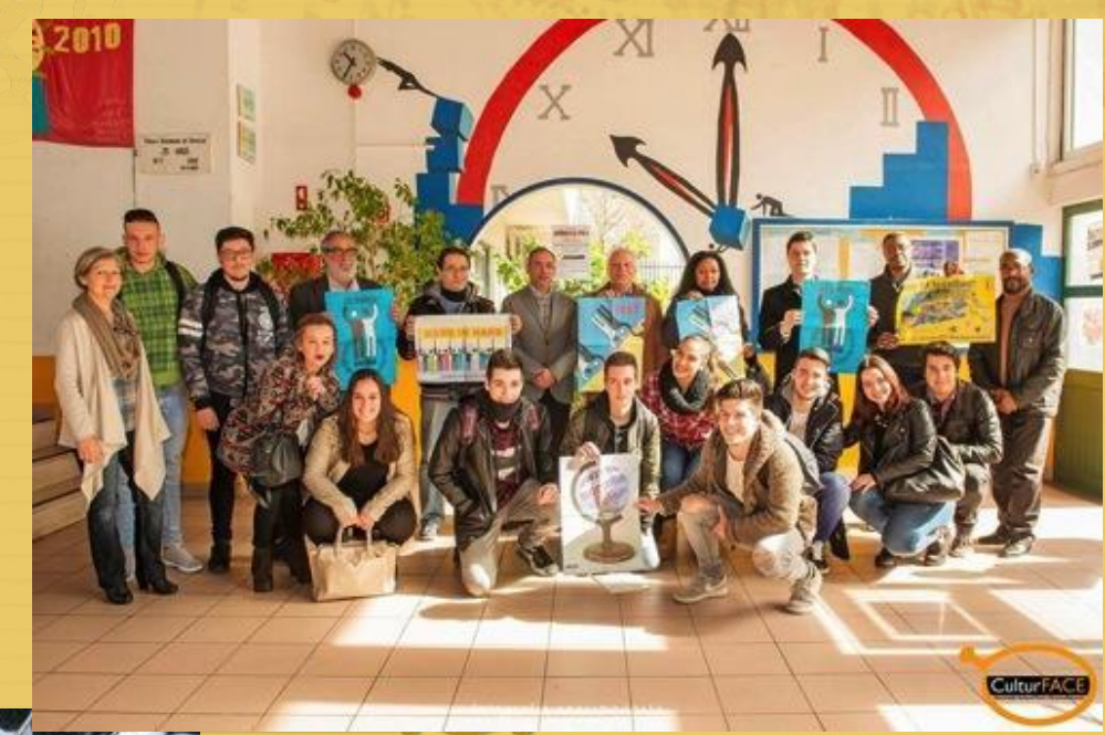
FAMIGLIE DI PACE PER UN MONDO MIGLIORE FB:FFPMU ITALIA