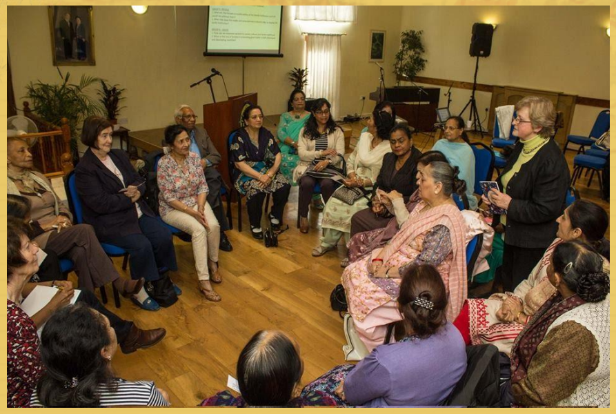
Int'l Day of Families, WFWP S.London/UK