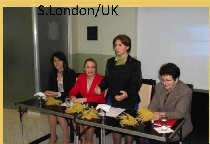
« Women's Participation for Development », Int'l Women's Day, WFWP Albania