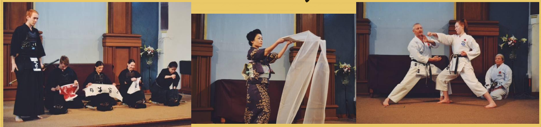
WFWP Scotland, "Experience Japan" at the Augustine United Church in Edinburgh.