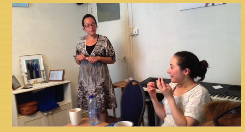
WFWP Germany- Interfaith discussion on gratitude