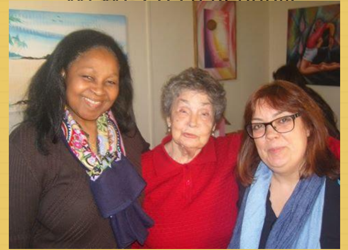
6th International Poetry Festival in Lisbon, WFWP Portugal