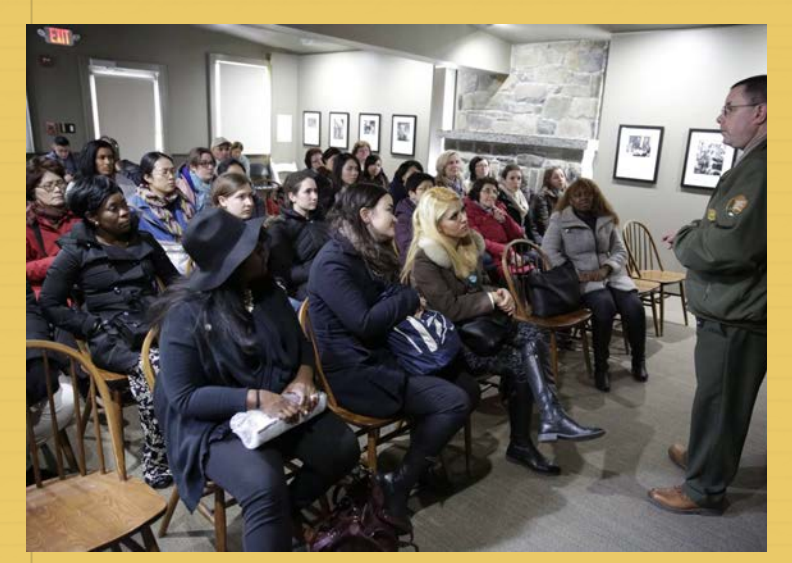
Eleanor Roosevelt's cottage