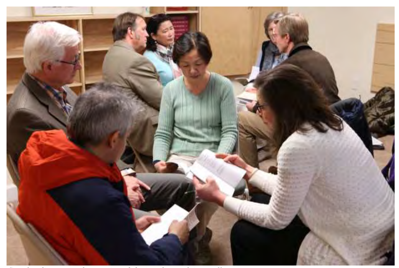
Couples discuss reading assigned during the week in small groups

After the first week, one of the husbands wrote me an email to tell me that he had never realized that other couples went through the same things that he and his wife went through, and learning that helped him to normalize his challenges. I think that is one of the greatest benefits to working on our marriages in a small group environment – we learn from each other, and we help each other laugh at our common weaknesses, encourage mutual vulnerability and support each other's tiny victories.