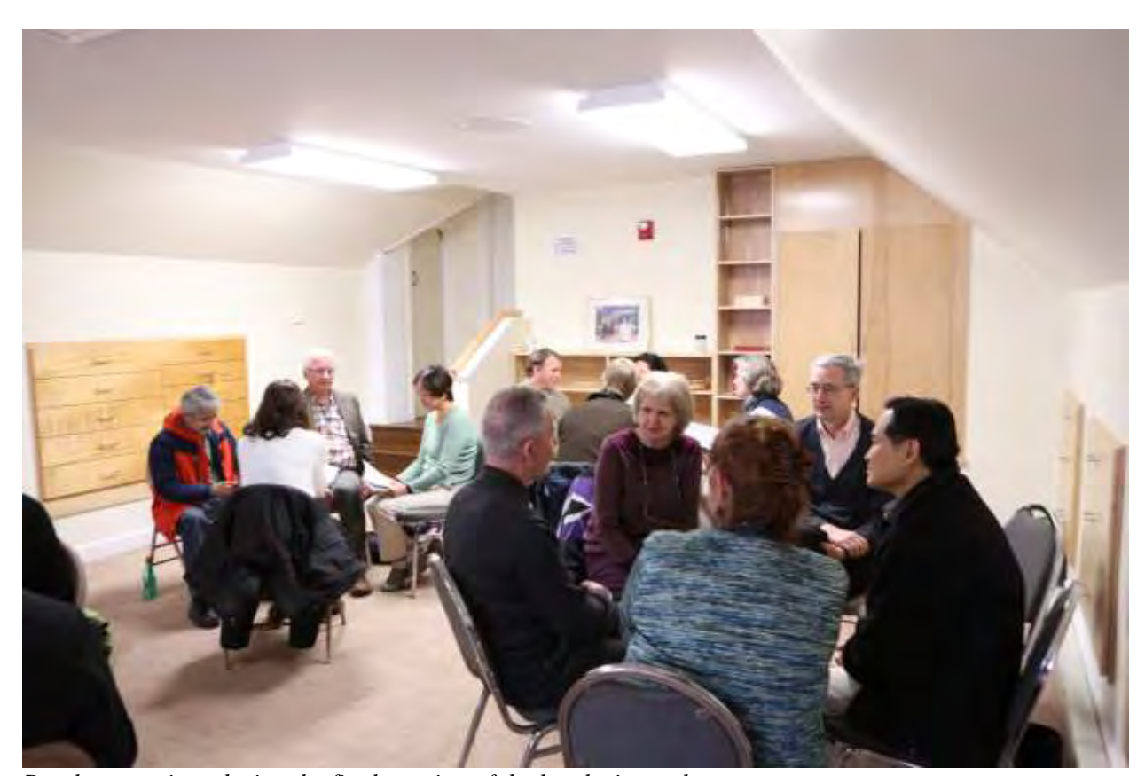
Breakout sessions during the final meeting of the local, six-week program

learning experience to attend without a spouse as with, and encouraged people to come anyway.