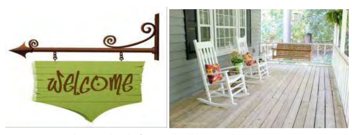
As you arrive, the front porch will be our welcome center.

Our ideal future location is a renovated barn. We love the warmth and homeyness of the rustic wood tones. Our barn church will be a welcoming atmosphere, a home away from home. It's not the typical church you would expect but that's because we're not your typical church.