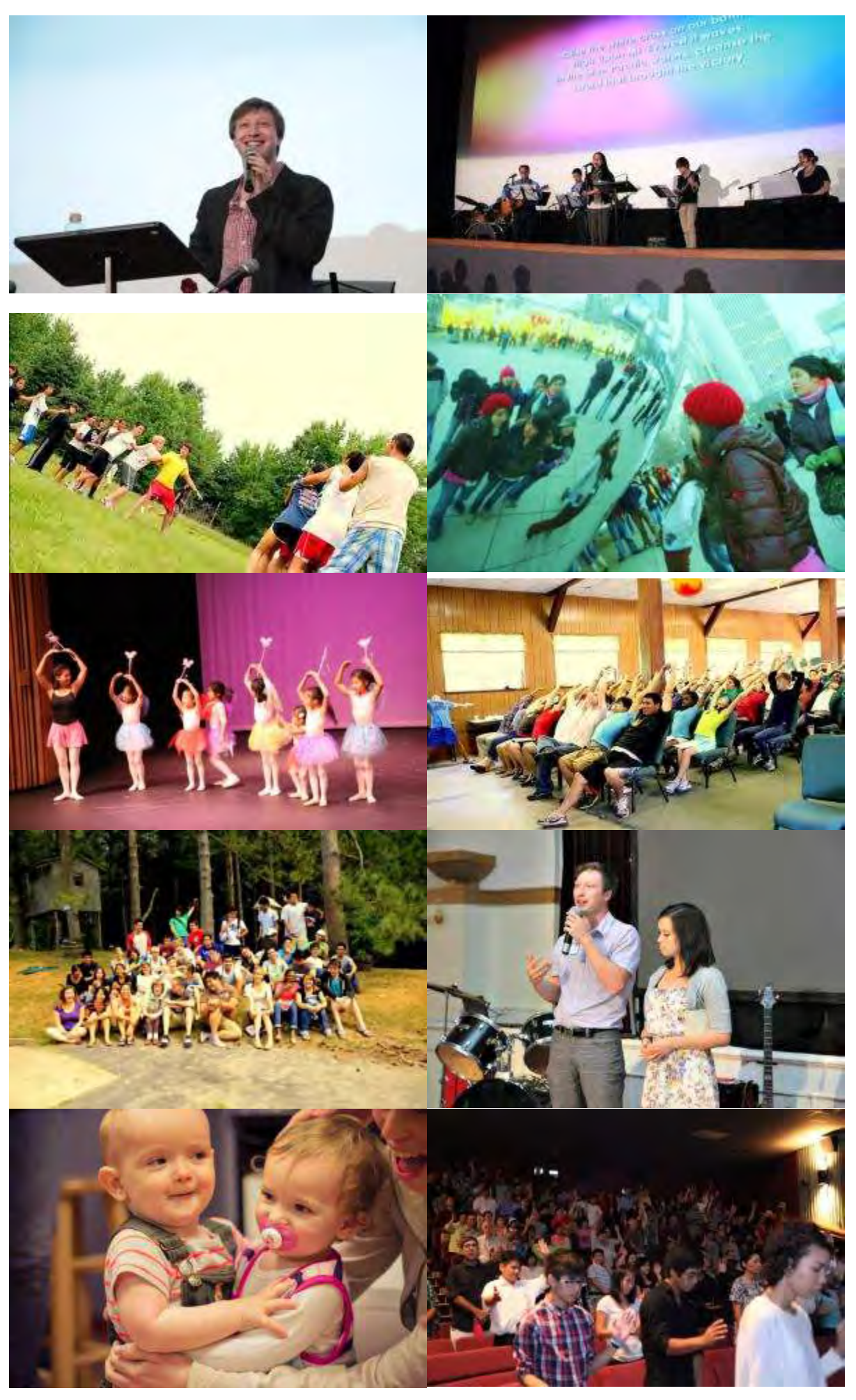
We'll be sharing updates on this blog with photos and stories along the way. Here it goes!

lot of churches in the summer and learn best practices. We also want to start by doing service projects in the town we will be located. The summer will be a time of preparation for our launch in the Fall. We hope that our efforts can inspire others to make their dreams a reality. God has implanted unique talents, passions and interests in each of our hearts; it's up to us to decide what to do with it. Photos of some highlights of the past few years that led us to this point: