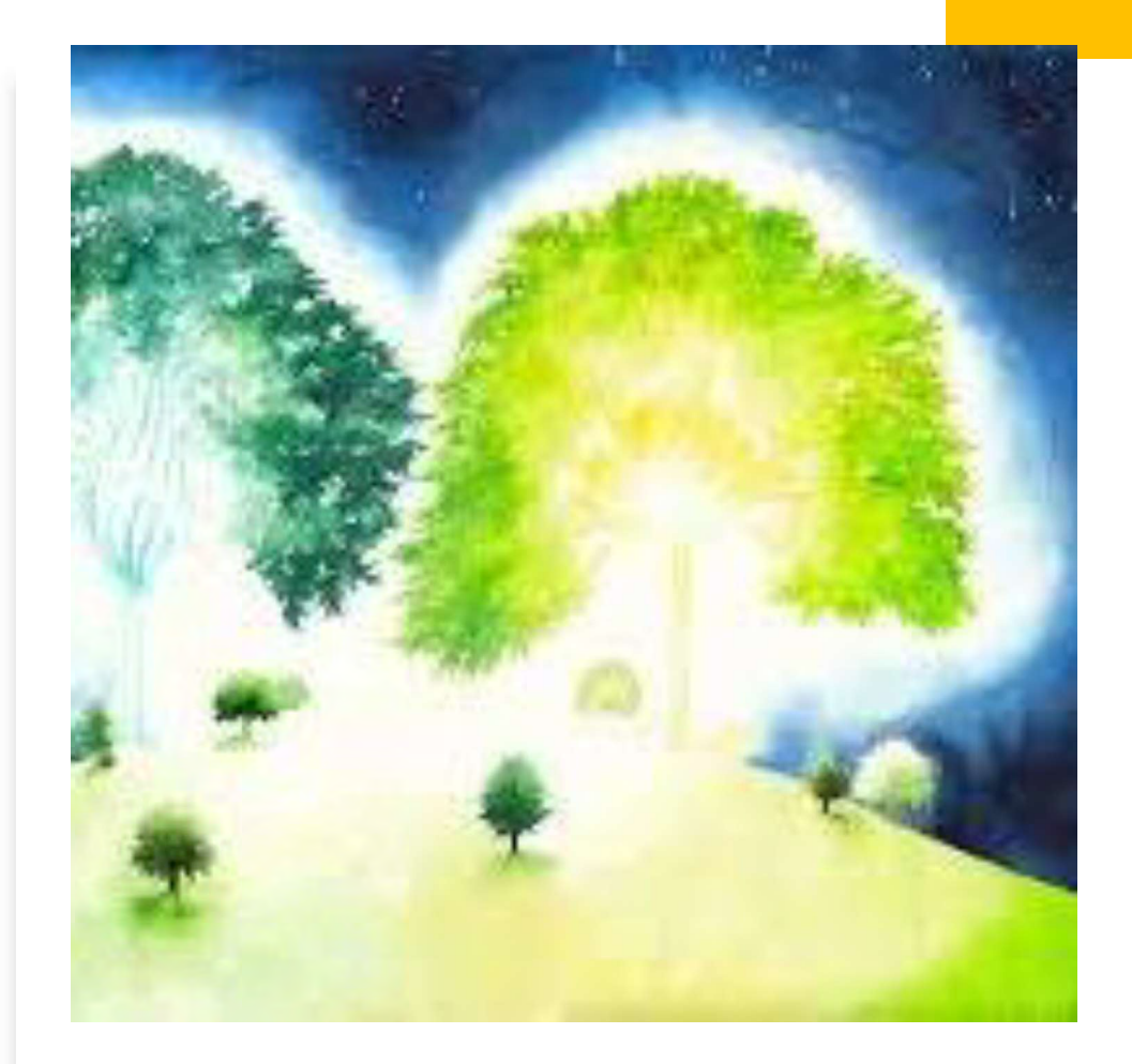
Two trees garden of eden steemit.com