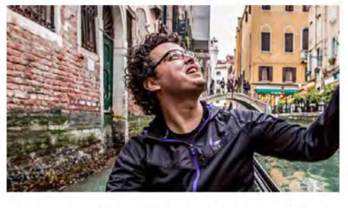
4 Smart Ways To Start Off The New Year