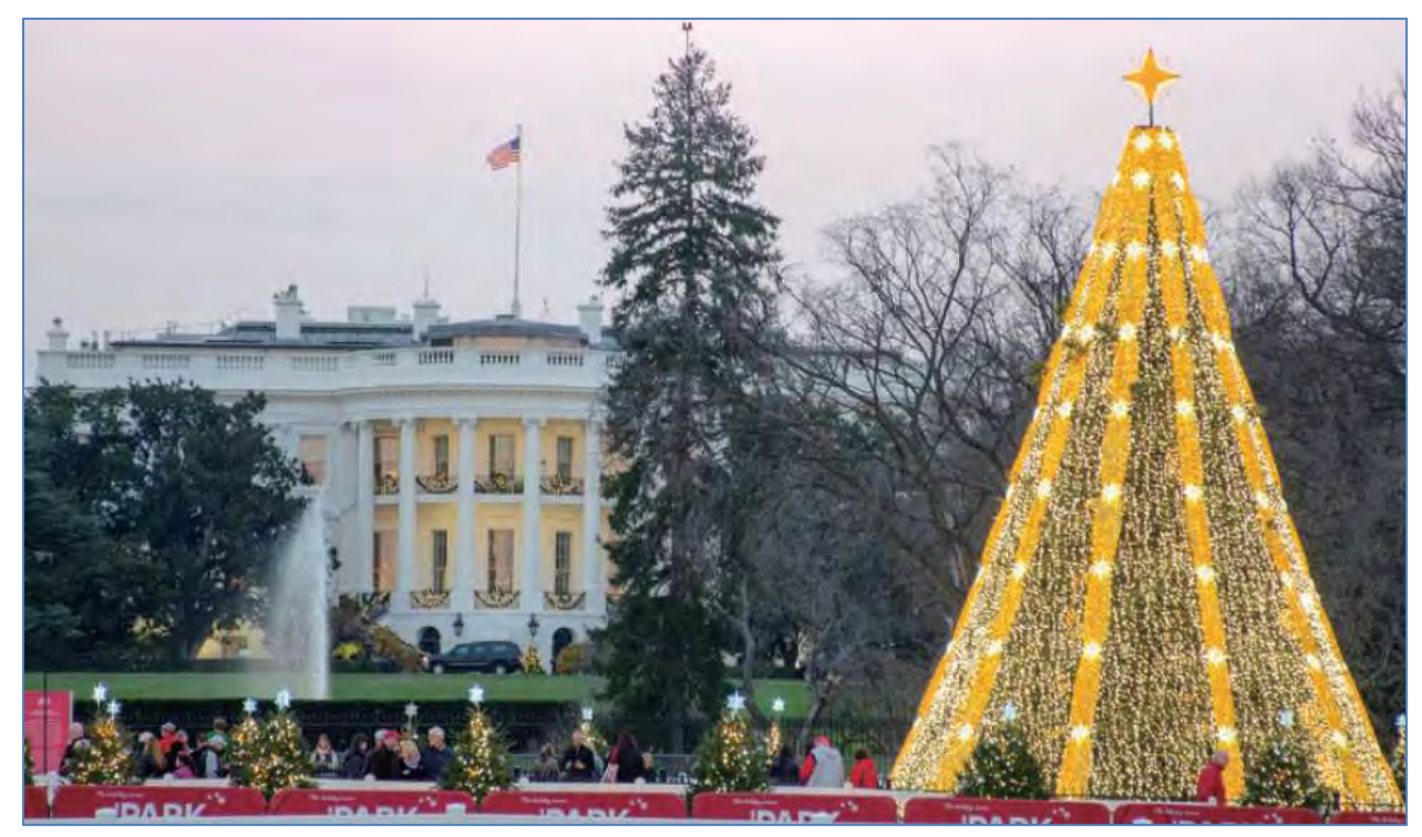
Since 1923, the United States has had a National Christmas Lighting Ceremony. The writer described his experience at the 1973 ceremony

The bright young people that I met captivated me. I found the atmosphere that surrounded them attractive. I suppose they were love-bombing me, but I liked it. After the event, I left immediately and was back on duty at the Marine barracks. No one ever re-contacted me.