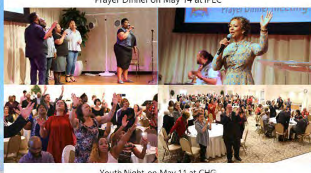
Youth Night on May 11 at CHG