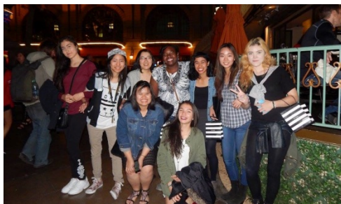
LVFC girls night out