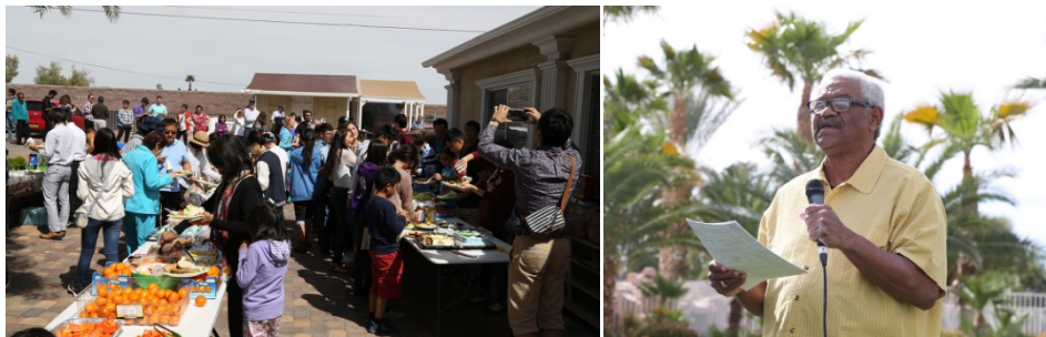
Easter Celebration on March 27