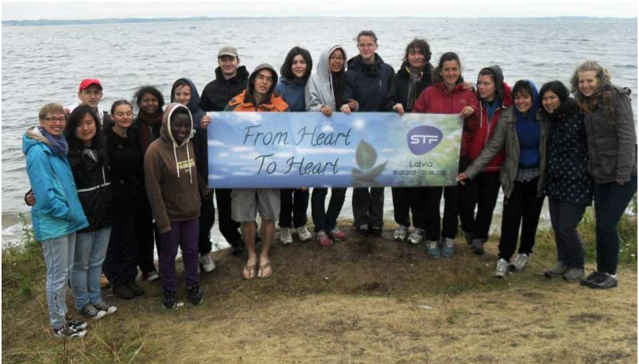
18 of the STF'ers and one young lady who was introduced to the DP by the STF witnessing team in Manchester, who just came back from a service project called 'From Heart to Heart' pictured here in Latvia.